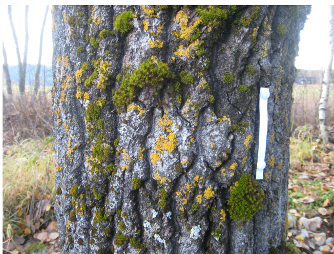
Figure 1. A Physcietalia vegetation with a large cover of Orthotrichetalia moss species, or an Orthotrichetalia vegetation invaded by Physcietalia lichen species? We prefer an integrated approach with both bryophytes and lichens included: several moss species ( Lewinskya speciosa , Nyholmia obtusifolia (both species formerly in the genus Orthotrichum , hence the name Orthotrichetalia ; Goffinet et al. 2004, Sawicki et al. 2010, Lara et al. 2016), Pylaisia polyantha ) and many lichen species ( Athallia pyracea , Caloplaca cerina , Candelariella xanthostigma , Myriolecis dispersa , Phaeophyscia orbicularis , Physcia adscendens , P. aipolia , P. stellaris , Toniniopsis subincompta , Xanthoria parietina ) were identified in an Orthotricho-Physcietea vegetation on a Populus tremula trunk (Koppang, Norway 2020). The length of the scale bar (white piece of paper) is 10.0 cm.

Many bryophyte and lichen species share the same habitat and substrate and are subject to the same (a)biotic conditions. Therefore, whenever possible, we integrated bryophyte and lichen syntaxonomy. As a result, our choice of syntaxa and syntaxon names fits the Dutch situation well but is not always in accordance with the International Code of Phytosociological Nomenclature (ICPN) (Weber et al. 2000). To illustrate this, we combined the 'bryophyte class' Frullanio dilatatae-Leucodontetea sciuroidis Mohan 1978 and the 'lichen class' Physcietea Tomaselli and De Micheli 1952 into one integrated class divided into the bryophyte-dominated order Orthotrichetalia Hadač in Klika and Hadač 1944 (originating from the Frullanio-Leucodontetea ) and the lichen-dominated order Physcietalia Hadač in Klika and Hadač 1944 (originating from the Physcietea ). According to the ICPN, the new name should be: Physcietea Tomaselli and De Micheli 1952. As in our integrated class both bryophyte and lichen species play a more or less equally important role, we combined both the original class names into the new name Orthotricho-Physcietea Tomaselli and De Micheli 1952 (Fig. 1), although not valid according to the ICPN. Why we chose to follow the ICPN in specific cases, and why we chose to divert from it in many other cases, is extensively