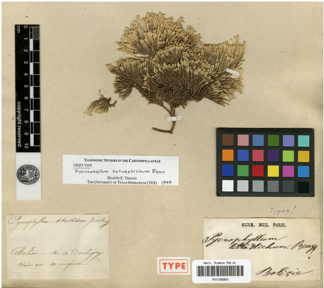
FIG. 5. Lectotype (P 00156960) of Pycnophyllum tetrastichum . — Reproduced by kind permission, © MNHN collection-Paris.

designated here: MOL!; ISOLECTOTYPES: G!, US!).