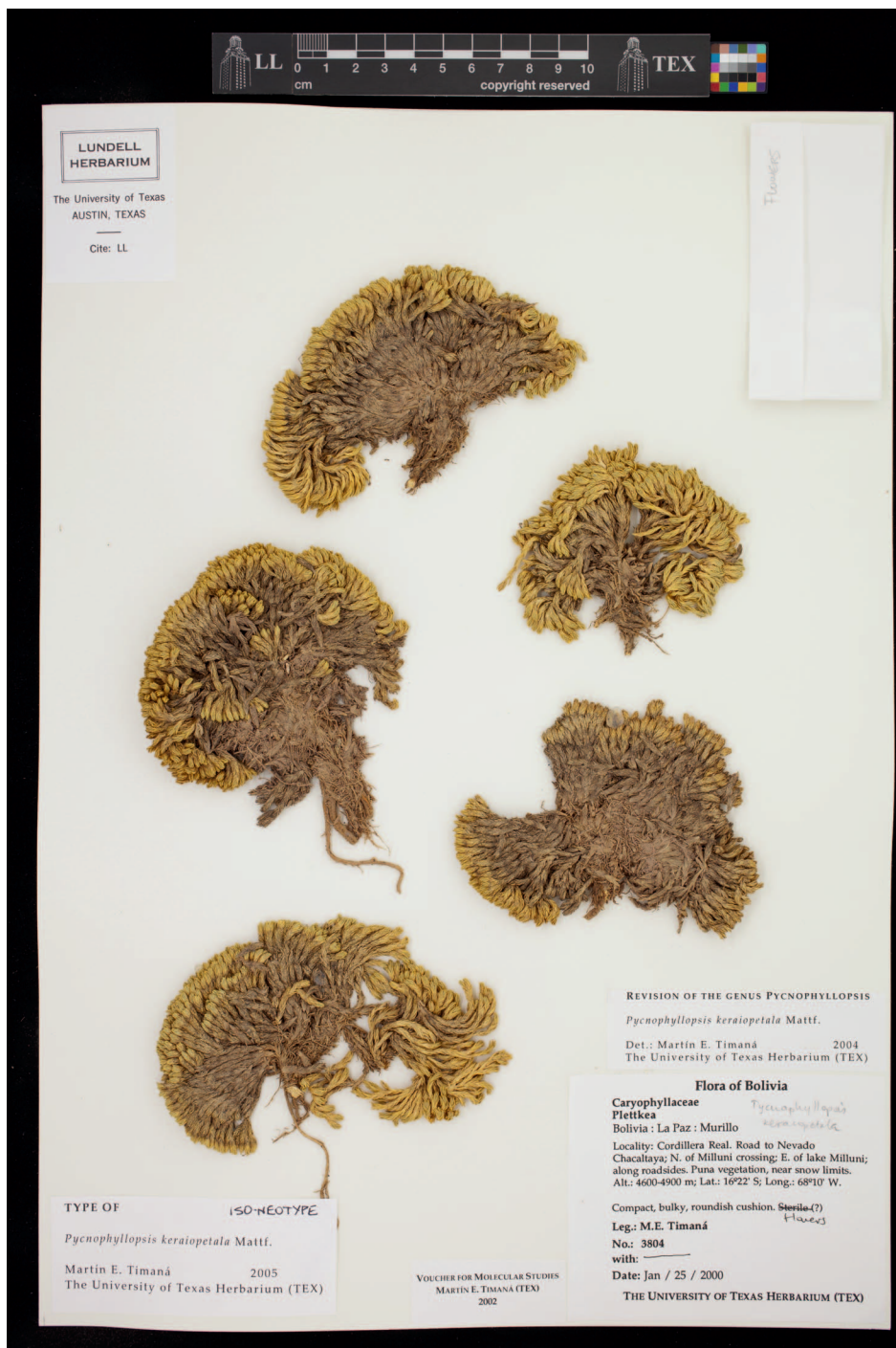
FIG. 1. Isonotype of Pycnophyllopsis keraipetala . —The University of Texas Herbarium (LL).