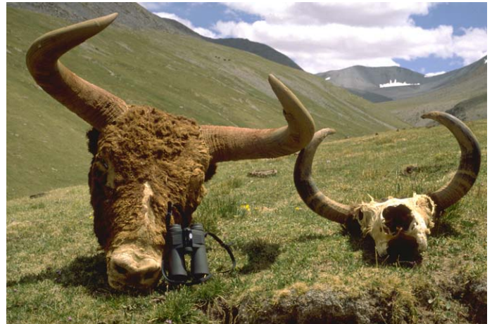
Fig. 3. —Skulls of male (left) and female (right) wild yaks ( Bos mutus ) from Yeniugou, central Qinghai, China, highlighting relative mass and sexual dimorphism in skull size and horn shape.

Relative to mass, a small female wild yak may be only one-third the size of a large male; in contrast, female domestic yaks are 25–50% smaller (Harris 2008; Miller et al. 1994; Wiener et al. 2003). Body mass (kg) of adult male wild yaks has been estimated at >800 kg (Engelmann 1938) and as high as 1,000 kg (Schäfer 1937; Wiener et al. 2003:43) and 1,200 kg (Lu 2000; Lu and Li 1994); females are about