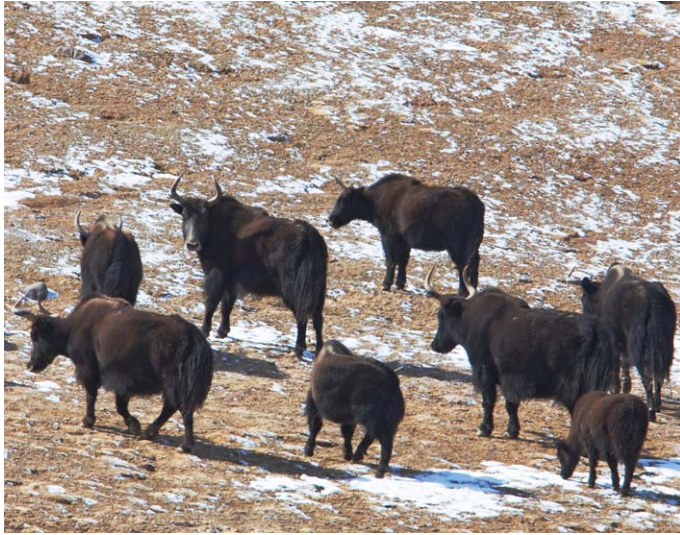
Fig. 5. —Wild yak ( Bos mutus ) adult females and calves in Yeniugou, central Qinghai, China.

males advancing to reconnoiter” (Przewalski 1876:190; Rawling 1905; Schaller 1998).