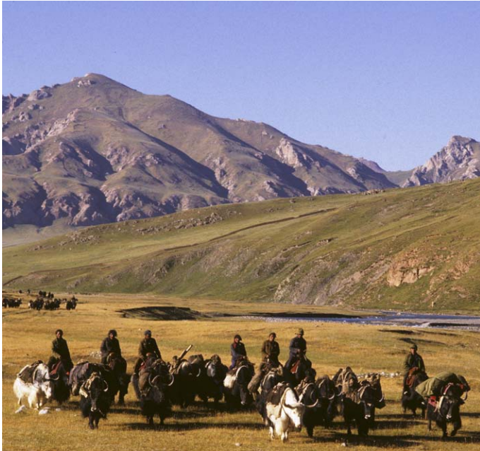
Fig. 6. —Nomadic pastoralists were dependent on domestic yaks ( Bos grunniens ) to move supplies throughout the Tibetan Plateau; trucks now deliver most supplies.

Because of the harsh environmental conditions in the Tibetan Plateau, the genesis and persistence of nomadic pastoralism likely involved an early domesticated form of the wild yak (Buchholtz and Sambraus 1990; Goldstein and Beall 1990). Although the specifics of the domestication of the yak are obscure (Rhode et al. 2007), it is thought to have occurred during at least 2 separate events (Bailey et al. 2002) in the northern part of Tibet (Flad et al. 2007). The 2,500-year-old Ordos Bronzes of the horned heads and bodies of domestic yaks that form buckles and plaques from Tibet through southern Russia attest to the species' cultural importance after domestication (Olsen 1986).