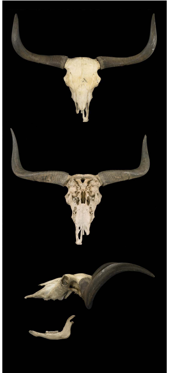
Fig. 4. —Dorsal, ventral, and lateral views of skull and lateral view of mandible of an adult male domestic yak ( Bos grunniens ); zoo specimen of unknown origin (National Museum of Natural History, specimen 174734). Greatest length of skull 525 mm.

The alimentary organs of the yak have evolved to deal with the limited forage availability and quality in its native range (Wiener et al. 2003). The mouth is broad, muzzle small, and lips flexible. Incisors have flat grinding surfaces,