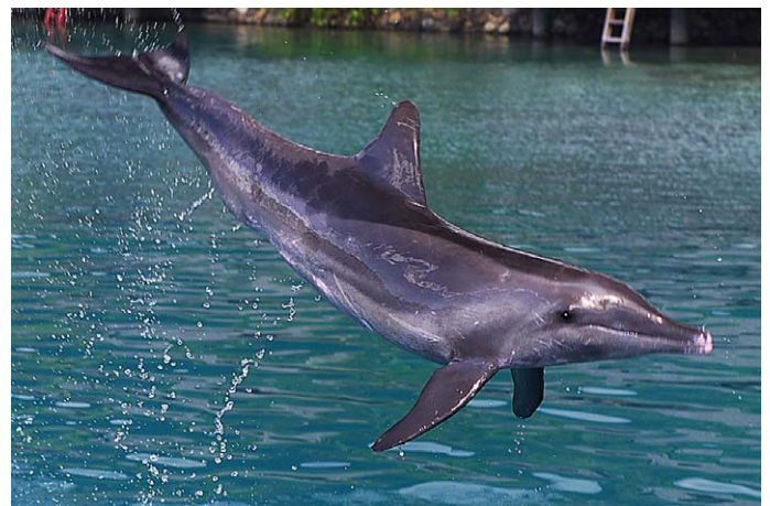
Fig. 1. —Pubertal male Steno bredanensis from Dolphin Quest French Polynesia, photographed in 2000. Dolphin Quest French Polynesia (The Moorea Dolphin Center) is a captive-care facility that houses dolphins in French Polynesia, located in the South Pacific. Used with permission of the photographer Cecile Gaspar.

CONTEXT AND CONTENT. Context as for genus. Species is monotypic.