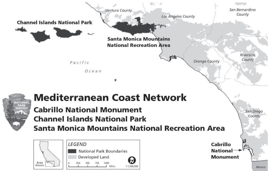
Fig. 1. Map of the Mediterranean Coast Network.

end, the 270 NPS units with significant natural resources have been divided into 32 networks based on their shared natural features and systems. Among these networks is the Mediterranean Coast Network (MEDN), which encompasses the southern third of the California coast (Fig. 1). Within the MEDN are 3 park units: Cabrillo National Monument (CABR), Channel Islands National Park (CHIS), and Santa Monica Mountains National Recreation Area (SAMO). Although none of these units were created with fossil resources in mind, each of them includes abundant fossils. In fact, CHIS and SAMO have some of the most extensive fossil records of any NPS unit.