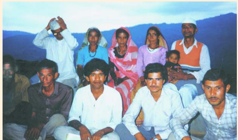
FIGURE 1 Members of a Forest Council in Ranikhet Development Block, Kumaon.

The governmentalization of communities went hand in hand with the creation of regulatory communities. This is perhaps the most critical aspect of any program of environmental decentralization. Lower level units in a territorial-administrative hierarchy, such as the forest councils, are granted powers of governance from a central authority. But in turn they are required to regulate the actions of their members—the common villagers—