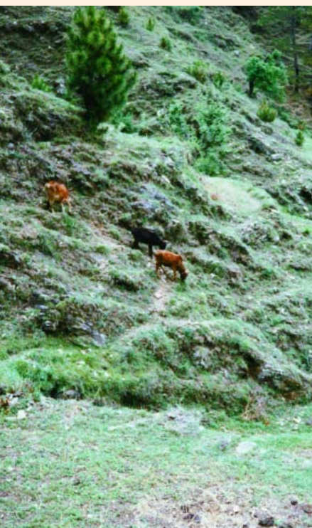
FIGURE 3 Common land under the control of the Revenue Department, Uttar Pradesh Government, 1993.