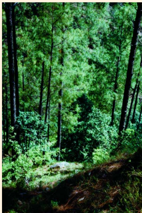
FIGURE 4 Common land under the control of the Forest Council, Almora District, Kumaon, 1993.

households can either monitor each other in the course of performing other tasks or be assigned monitoring responsibilities for a given duration. Under third party monitoring, specific persons have the power to ensure that others are following rules. But the payments for this specialized job can come from several different sources.