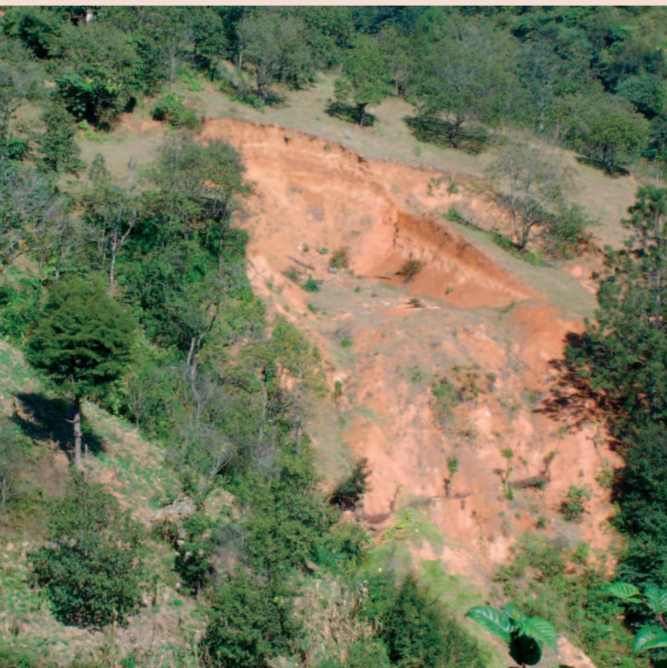
FIGURE 3 Landslides are a common hazard in the Sierra Norte de Puebla.