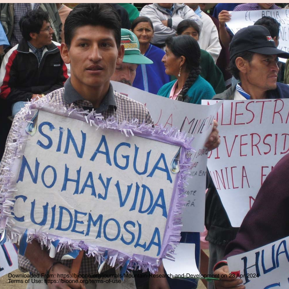
FIGURE 5 “Without water there is no life. Let’s take care of it.” Placard in Rio Blanco.

The primary objective of a water quantity study is to quantify potential effects of mine operations and facilities on surface water flow and flow from springs. Discharge should be measured continuously at the most important sites. A less expensive method for continuous measurements of discharge uses pressure transducers that are placed on the stream bottom. In both methods, a stage–discharge relationship needs to be developed for the specific locations using manual measurements of flow. Infiltration rates to the subsurface are estimated by collecting soil cores and testing them to learn how the soils in the study area store water and how water moves through them. Soil cores should be collected periodically from the tailings pile and the same measurements conducted to understand how much water may be infiltrating the tailings pile and flowing over the surface of the tailings pile.