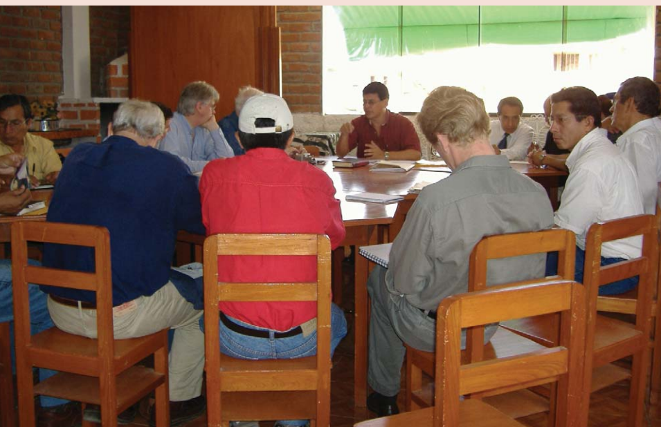
FIGURE 3 Consulting with stakeholders.

A well-designed and executed monitoring plan for water quantity and quality is critical to foster dialogue, consensus, and trust between the mine and the community. Any monitoring conducted must be conducted in a transparent, publicly available, and inclusive manner. The monitoring plan should have the capacity to adapt to changes in mine operations as the mine grows, closes old operations, and explores new areas. Any monitoring plan must have a formal, independent, external verification program. We cannot emphasize this point enough.