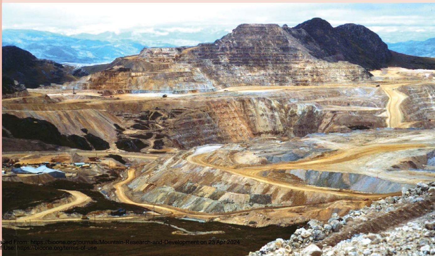
FIGURE 1 View of the Yanacocha open pit gold mine in northern Peru—the largest and probably most profitable in the world.

The delegation engaged with the mining company, national government, and a range of national, regional, and communi-