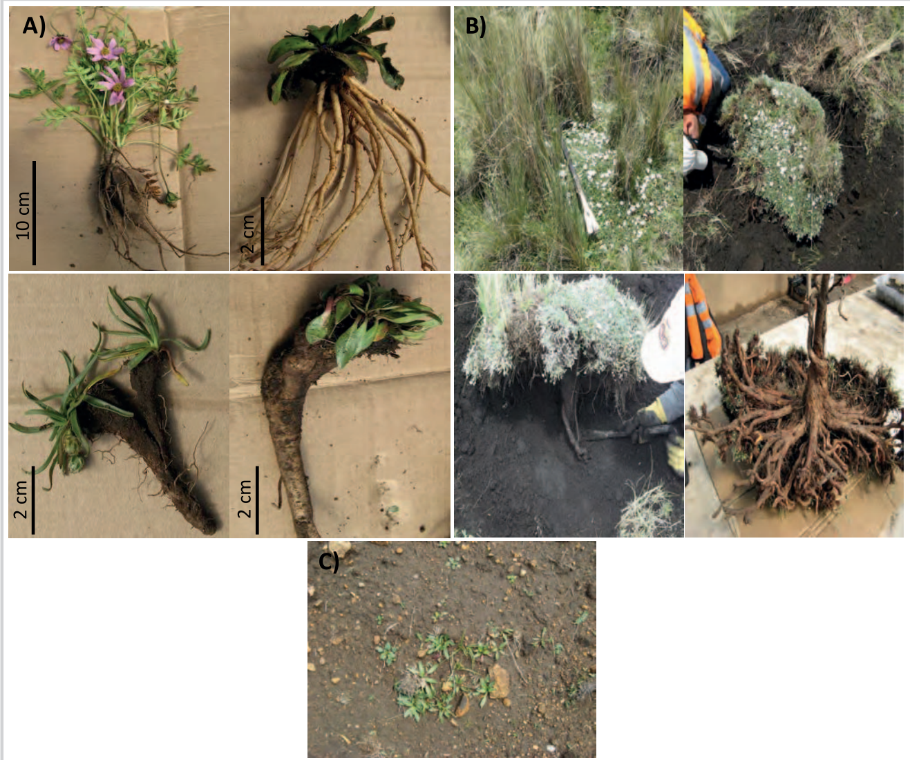
FIGURE 1 (A) Observation in the field suggests that resprouting capacity from underground storage organs is common on the Peruvian Altiplano. (B) A species from the Nototriche genus (Malvaceae family), in which resprouting is an ancient trait for long-term persistence. To casual inspection, these plants look like insignificant annual herbs. However, when excavated it becomes apparent that these plants may be very old (perhaps 800 years old) and that they are heavily reliant on resprouting from underground storage organs for their persistence. (C) The surface of a recently created topsoil storage pile for a new mine on the Peruvian Altiplano. This photograph shows that resprouting can occur when topsoil is redeployed immediately, but only in the superficial layer of the pile. Rhizomes buried deep within the topsoil pile will putrefy after a year or two.

rhizomes buried underground, which reveals an adaptation to harsh conditions such as pronounced seasonality.