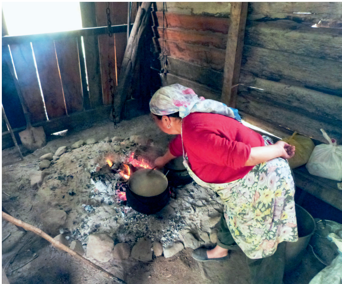
FIGURE 3 Mapuche woman preparing mote (wheat peeled with ashes) in her fogón .

preparing lunch very early in the morning, and, immediately after lunch, they kept cooking to prepare supper. Every meal was prepared from scratch with homemade ingredients. According to most women participants, it seems that today, they are not willing to make such an effort everyday as there are market foods available that require less time and effort to prepare. Fry (2000) reported that the perceptions that traditional foods are inconvenient and time-consuming are the main reasons for a shift in diets in Mapuche families in Makewe in southern Chile. Lack of time was also reported by people from different indigenous communities of the Puget Sound in the Pacific Northwest as a barrier to accessing traditional foods (Krohn and Segrest 2010). Today, in Mapuche communities, traditional preparations are often reserved for special events such as the arrival of