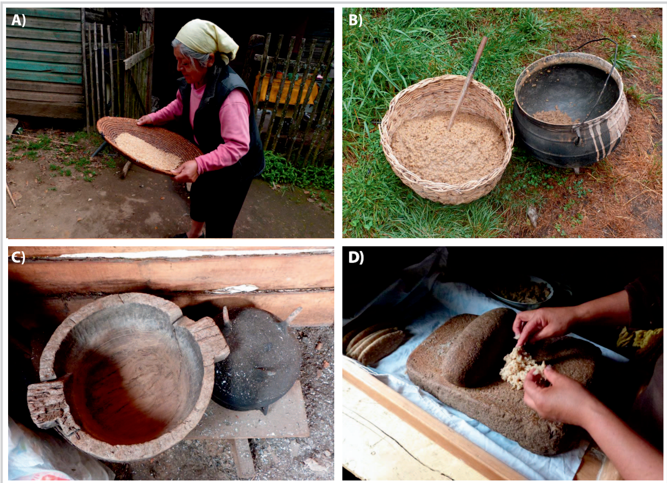
FIGURE 2 Traditional Mapuche cooking artifacts or utensils. (A) Women winnowing wheat using a llepü ; (B) a chaigüe full with recently cooked mote in an iron challa sitting beside; (C) a round wooden batea ; (D) kudi and ñumkudi for preparing wheat catutos .

interrupting the transmission of environmental knowledge and skills, as new generations are not learning what the elders once learned (Barreau et al 2016).