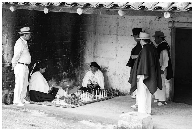
FIGURE 4 Oral traditions and storytelling are good ways to aid regenerative development by maintaining biocultural diversity and traditional practices of healing and other rituals associated with mountain livelihoods in the Otavalo valley, Ecuador.

transdisciplinary ontology of mountain theories to ease the transition to regenerative development thinking. These include the following: