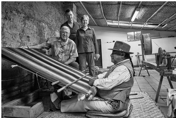
FIGURE 2 Extracurricular activity for lifelong learning of visitors exploring the artisan craft of an Otavaleño's textile-making workshop and ecomuseum, in Peguche, Imbabura province, Ecuador. Sharing stories and life experiences linked to the mountainscape and its mythologies that regenerate local knowledge is a strong motivation of ethnotourism in the Andes.

“Corporate Conscience,” each of which rely on traditional mountain geography. These lead to the implementation of the new pedagogical approaches presented below. The imperative of reducing barriers to environmental cognition is more crucial than ever (Ham et al 2010) with the internationalization of global education (Bishop 2009). We argue for broad application of the cross-cutting approach of montology (Sarmiento et al 2019) on behalf of a transdisciplinary wave that will educate the future citizens and denizens of mountain areas, maintaining ancestral and traditional ways of learning (Ball 2004; Ellis 2004; Wyndham 2010; Barreau et al 2019). We need to learn from failed attempts to achieve sustainability and integrate practical approaches of regenerative development. This will help to bridge the divides between the Global North and the Global South, between highland and the lowland ecoregions, between the education opportunities offered in schools versus home schooling, and between reductionist higher education and the holistic multiversities and practitioners of “real world” experience. We envision a montological framework that integrates different aspects of formal state education and private institutions, starting with young children and continuing to adulthood, in the so-called lifelong learning approaches to mountain cognition (Figure 2).