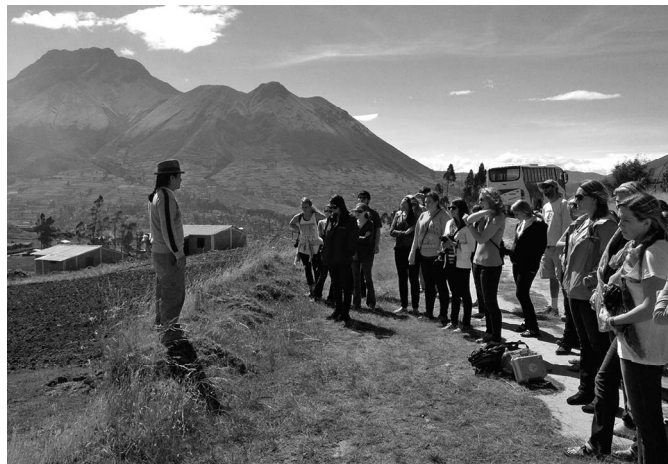
FIGURE 3 Field trips, study abroad, and other learning opportunities for outdoor education should be included in the montology educator toolbox, so that the content is linked with direct experience, such as with the group of students visiting the Imbakucha sacred landscape, now Imbabura Geopark, in Ecuador.

K-12 levels (primary and secondary education), as well as field trips, guided visits, and other cocurricular and extracurricular activities (Figure 3). Some programs have gained prestige and popularity among professionals. These include the United Nations Food and Agriculture Organization's International Programme on Research and Training on Sustainable Management of Mountain Areas with its 2-week course on mountain management in Italy, as well as special training offered by the International Centre for Integrated Mountain Development in Nepal and the Consortium for Sustainable Development of the Andean Ecoregion in Peru. Many universities offer mountain-themed programs, such as Colorado State University in the United States, the University of Central Asia in Kyrgyzstan, and the University of Innsbruck in Austria. Programs are also being tested in unorthodox systems of higher education (Ji 2011) and practiced in institutions such as the Franciscan Multiversity in Uruguay, the Latin American Multiversity of Higher Studies in Mexico, the Indigenous Multiversity for Traditional Knowledge in highland Peru, and the Technical “Multiversity” of Twente in the Netherlands. An agenda-making plan is dependent on situated knowledge, institutional support, and political will; however, these trends should be incorporated if montological approaches are to be followed.