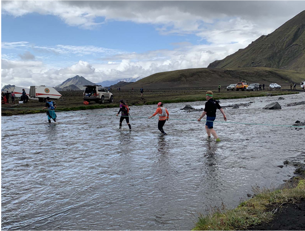
FIGURE 2 Runners participating in the LUM.

responses were recorded, then grouped, and categories were identified.