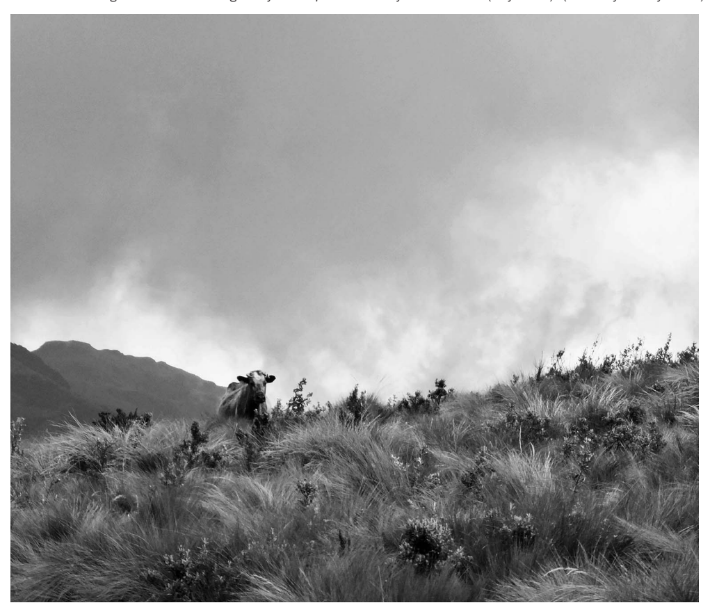
FIGURE 2 A lone ganado bravo roaming freely in the páramo on Cayambe volcano (July 2012).

supported projects in various communities in the region to improve and intensify dairy production. In Paquiestancia, this included a proposal for a pasture-seeding program to allow more intensive grazing on smaller properties near homes at lower elevations (FONAG 2011). In other Kayambi communities, it has included the support of improved pastures as well as veterinary care.