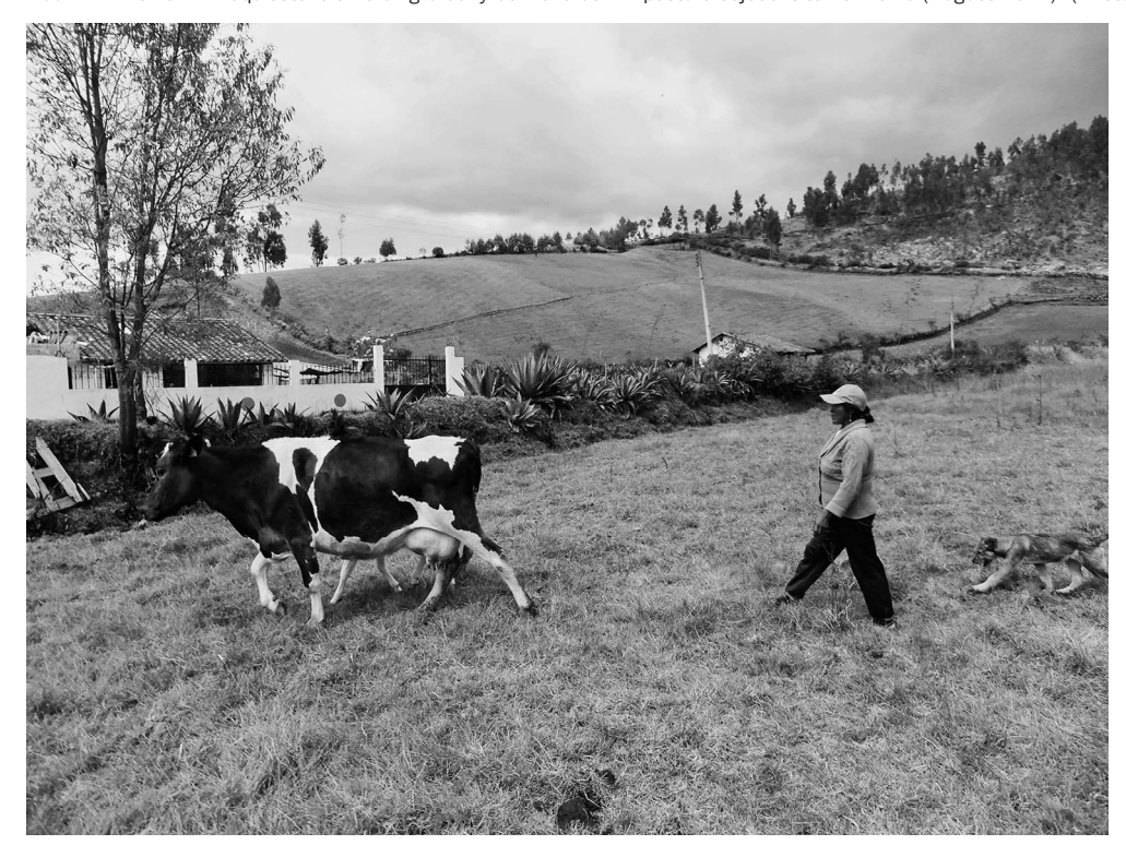
FIGURE 1 Woman in Paquiestancia herding a dairy cow and calf in pasture adjacent to her home (August 2014).

other communities involved with FONAG in Cayambe cantón.