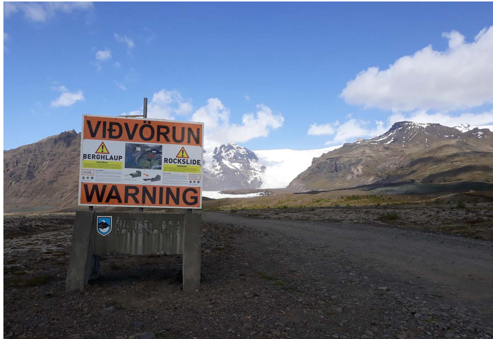
FIGURE 3 Large warning signs on access roads to Svínafellsjökull.