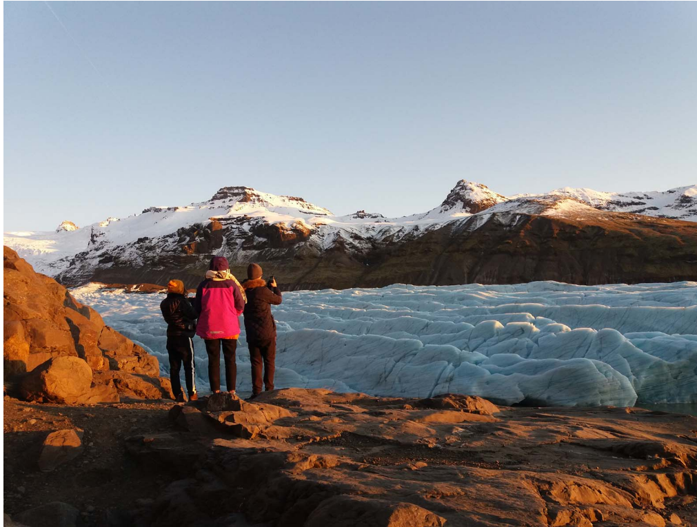
FIGURE 1 Tourists at the Svínafellsjökull viewing area, November 2019.

paid particular attention to foreign tourism employees, who constitute a large proportion of tourism employees in the area. A key finding is that despite demographic shifts, local Icelandic inhabitants remained the basic unit on which risk management processes were centered, with repercussions for the ways in which exposure was calculated and risk was communicated. Both tourists and tourism employees had a limited understanding of risk and emergency protocols compared with local inhabitants. We argue that for their own safety, and the safety of customers, risk communication needs to be tailored to the needs of tourism employees, including mountain guides and those in hospitality positions. The policy recommendations that emerge from this research can guide the development of risk communication strategies in nature tourism destinations facing sudden, large-scale hazards, including avalanches, flash floods, landslides, and volcanic eruptions.