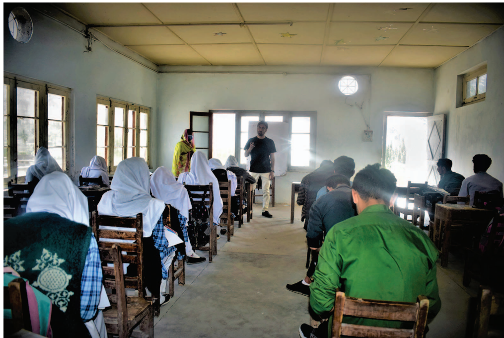
FIGURE 2 Interaction with students during a workshop in a local community school in Yasin Valley.

S = F/(NmP) , where S indicates the cognitive salience index, F represents the frequency of citation, N is the number of elements, and mP is the mean position of each element used in the free lists. The cognitive salience index varies between 0 and 1. The index is generally used to identify the most important plant species used in a specific community or cultural group.