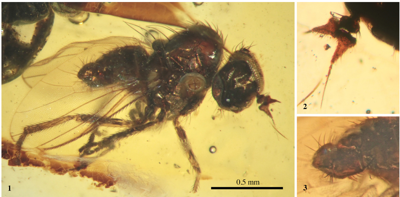
Figure G1. Microphorites magaliae n. sp., holotype male IGR.GAR-106a, in Late Cretaceous amber of Vendée, NW France. 1, habitus in right lateral view; 2, detail of antennae; 3, detail of the genitalia.

terminalia rotated forward beneath the preceding segments of the abdomen (Wiegmann, Mitter, & Thompson, 1993). Microphorinae and Parathalassiinae are distinguished from other dolichopodids by the presence of an additional basal crossvein (bm-cu) and crossvein dm-cu connected to the base of M_2 . Recent molecular analyses even suggest that Parathalassiinae are part of Dolichopodidae s.str. , with Microphorinae as sister group to the latter (Germann & others, 2011).