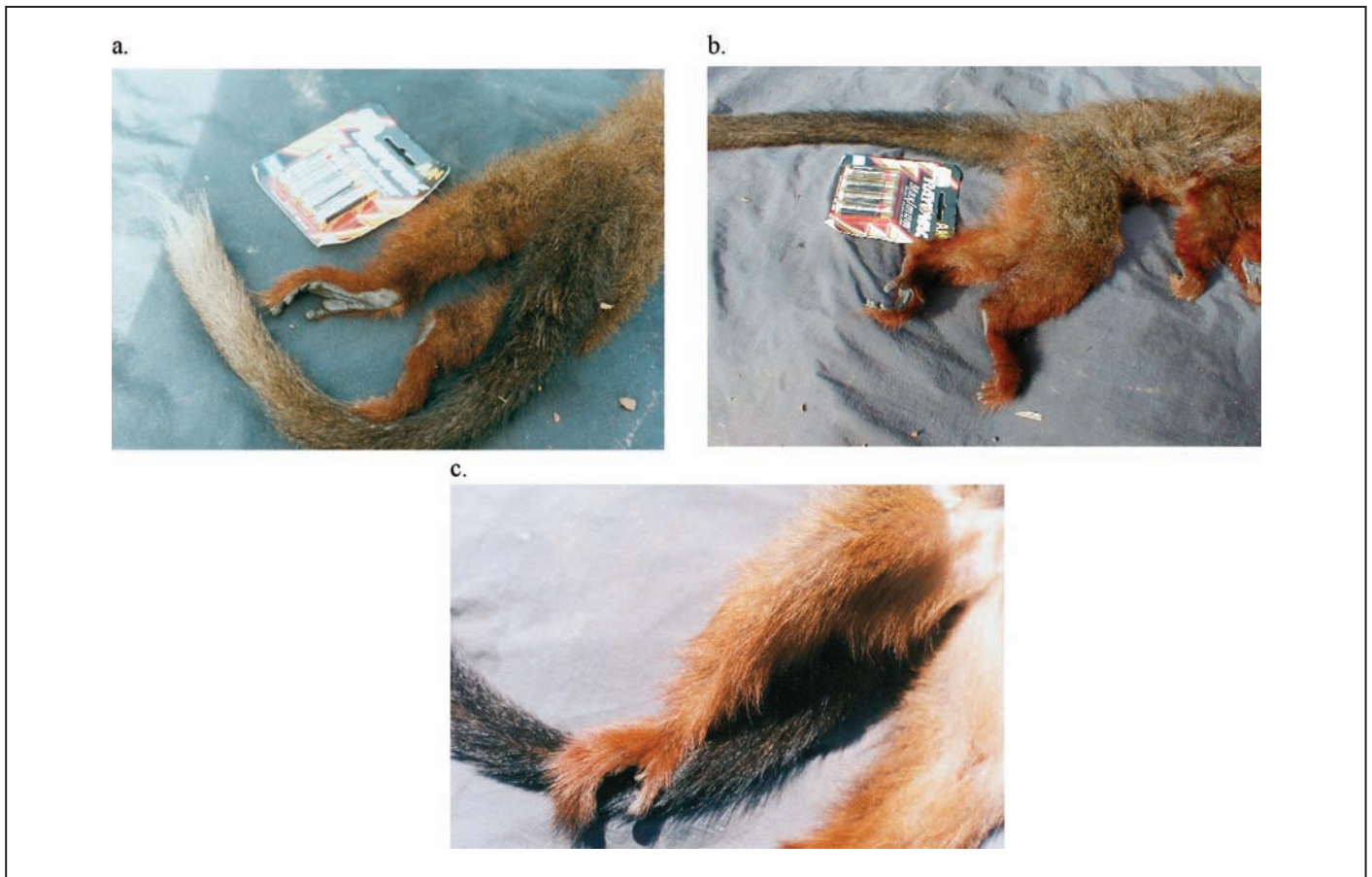
Figure 5. Details of the adult male holotype C. aureipalatii (CBF7511): a. tail and hind feet, b. hind legs, c. hind foot.