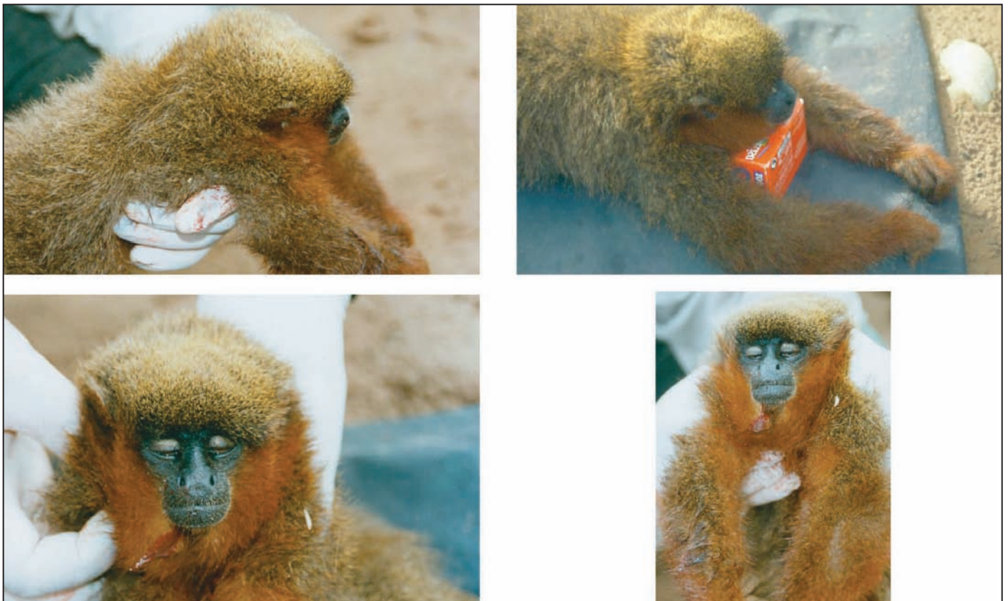
Figure 4. C. aureipalatii , new species. Views of the male holotype (CBF7511).