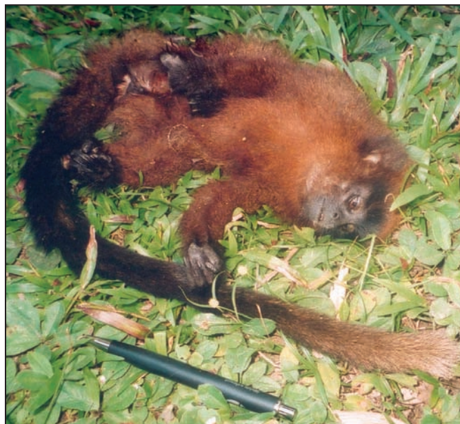
Figure 8. Callicebus specimen from Los Amigos, southern Peru.

Geographic Distribution: Callicebus aureipalatii was present at four of the line transect survey sites: Río Tuichi, Río Hondo, Alto Madidi, and Río Undumo (see Fig. 1). The literature review revealed a further 15 sites in the immediate vicinity of the known distribution where an unidentified Callicebus had been registered: Chalalán, Tumupasa, Capaina, Buena Vista, Santa Fe, Carmen Pecha, Bella Altura, Napashi, Santa Rosa de Maravilla, Altamarani, San Antonio de Tequeje, Carmen del Emero, Esperanza de Enapurera,