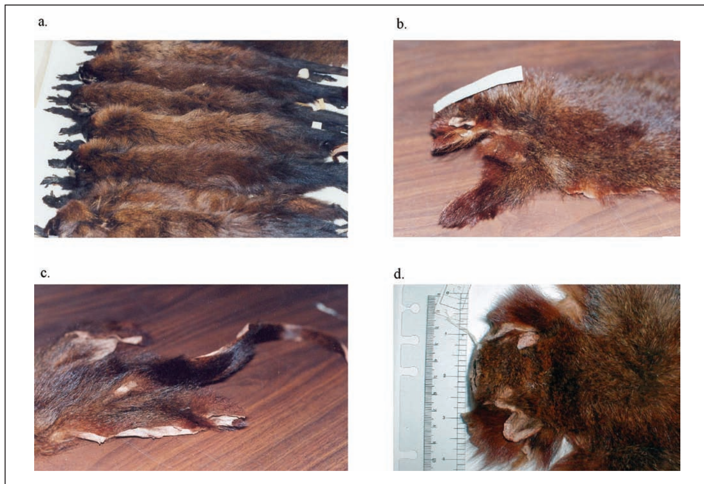
Figure 9. Specimens examined at the American Museum of Natural History; a. Callicebus brunneus series from Brazil; b., c., d., dorsal views of specimen (AMNH262650) collected in Chive, Madre de Dios, Bolivia.

AMNH it is classified as C. brunneus despite being markedly different from the main C. brunneus series collected in Brazil. Although the specimen displays some broad similarities with C. aureipalatii , for example, the rufous coloration on the limbs and general body coloration, neither the orange throat coloration nor golden crown are evident (Fig. 9). In short, further research is required to determine the taxonomic status of Callicebus populations in Pando Department, Bolivia.