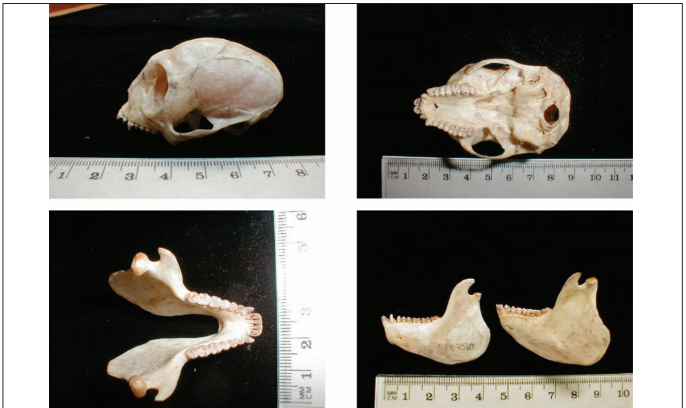
Figure 7. Skull of the adult male holotype of C. aureipalatii (CBF7511), and mandibles of the male holotype and female paratype (CBF7510). Note variation in the coronoidal forms of male (right) and female (left) mandibles.