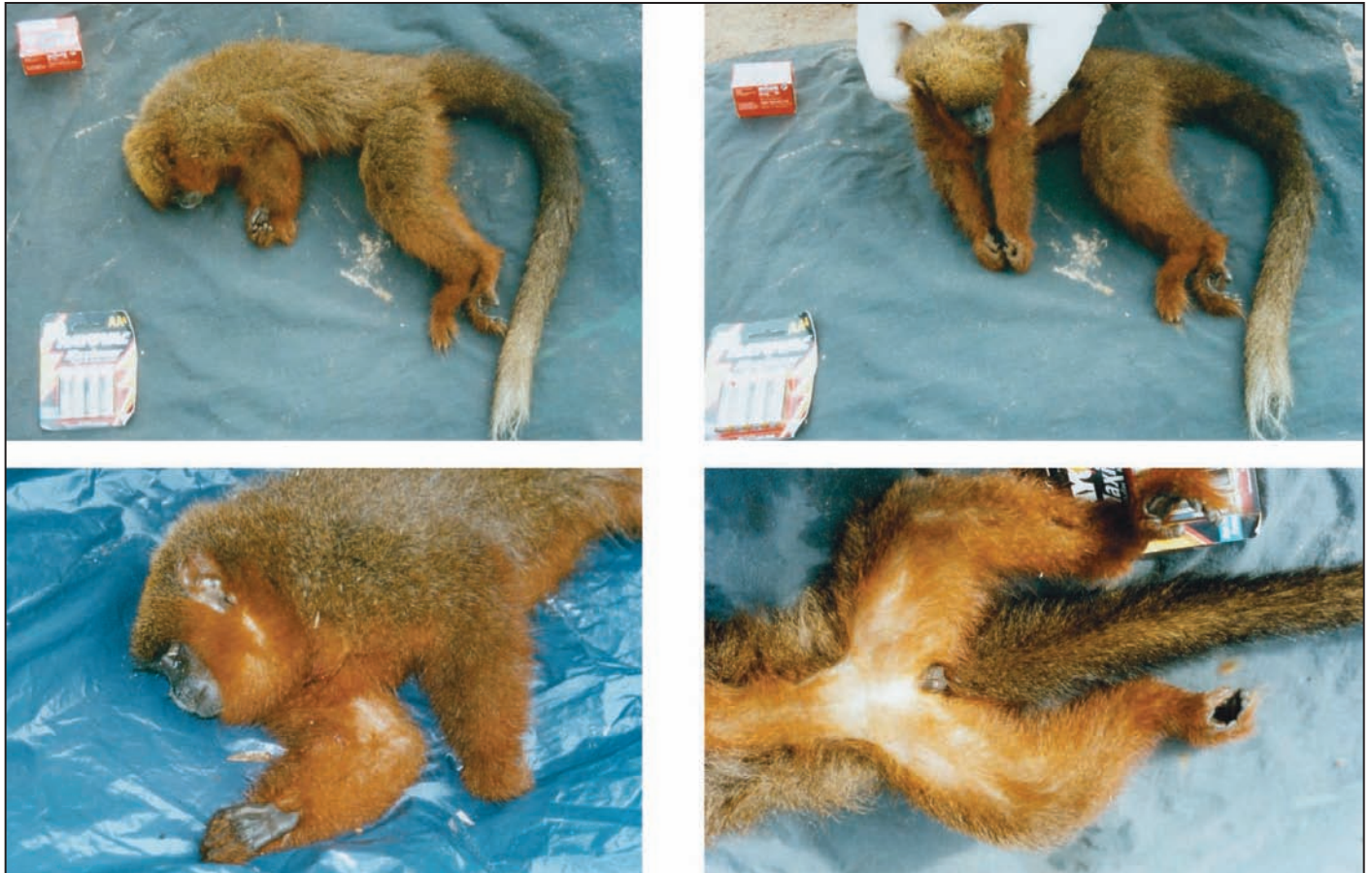
Figure 3. C. aureipalatii , new species. Views of the male holotype (CBF7511).