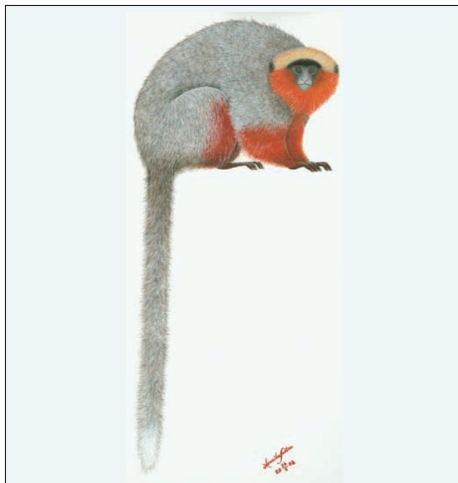
Figure 2. The Madidi titi monkey, Callicebus aureipalatii sp. nov. Illustration by Annika Felton.

Diagnosis: A species of the C. moloch group ( sensu Hershkovitz 1990; Groves 2001) as defined according to broad distributional and physical characteristics. Using the Van Roosmalen et al. (2002) classification, this new species shows physical similarities with the C. cupreus group (crown and cheiridia dominated by pheomelanin hair pigments, orange