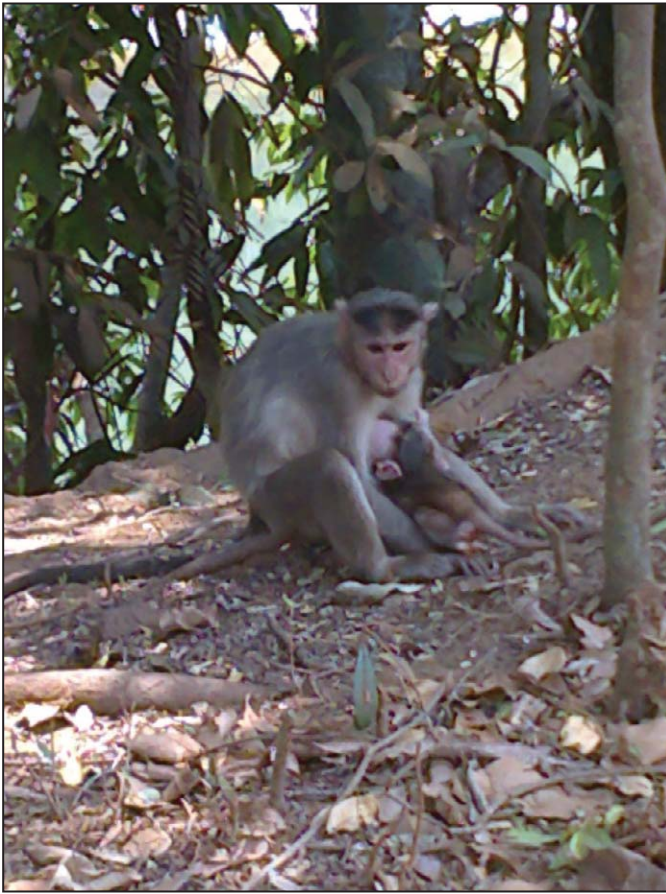
Figure 2. Bonnet macaque ( Macaca radiata ) mother and young, Goa, India.