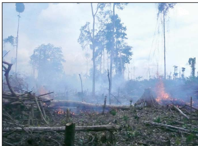
Figure 6. Forest cutting and burning by subsistence farmers at the former Ologbo Forest Reserve (4,000 ha), Edo State, southwest Nigeria. Photograph © Elizabeth J. Greengrass. 2008.

While the survey demonstrates the ability of chimpanzees to persist under conditions of high human pressure and disturbance, the viability of these remaining populations is in doubt. Timber trees can contribute disproportionately to the diets of some primate species (Chapman and Peres 2001), indicating that logging has a severe impact by reducing food availability. While chimpanzees do have flexible diets, their energy requirements as large primates with large home ranges predisposes them to a reliance on high energy fruits. Diet quality and feeding efficiency may determine certain aspects of sociability and female reproductive success (Greengrass