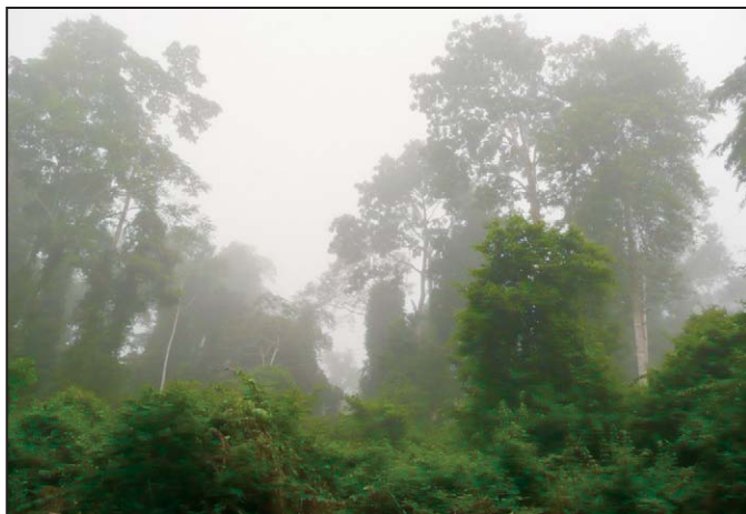
Figure 4. The broken forest canopy, partly the result of past logging, on the periphery of the Okomu National Park (21,200 ha), Edo State, southwest Nigeria. The forest improves as you travel further into the park and is probably the best example of mature secondary forest in southwest Nigeria.

and logging pressure was intense and increasing. However, the timber industry is highly organized and illicitly supported at all levels of government, and where corruption is institutionalized there is little incentive to correct this. Legitimate companies practicing long-established working plans that were in the majority 30 years ago are now all but absent from