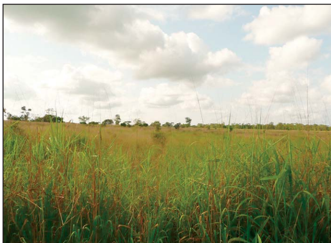
Figure 3. ‘Derived’ savannah that has replaced much of the rain forest in southern Nigeria today. These grasslands are the direct result of unsustainable logging and farming practices over an extended period of time. Photograph © Elizabeth J. Greengrass. 2008.

Chimpanzees were confirmed at seven sites based on the direct and indirect evidence collected by the author. Chimpanzees were probably present at two more sites, based on the reports of hunters and the quality of the habitat (see Table 1 and Fig. 1). Chimpanzees were extinct at two sites that had been completely converted to farmland and where no natural forest remained. At three more sites chimpanzees were either extinct or very close to extinction. Forest conversion was such that very little natural habitat remained, and could not have supported more than a few individuals. At Akure Forest Reserve, for example, the only natural forest remaining is the Queen Elizabeth Plot (2–5 km 2 in size). Despite the proximity of humans, many of whom hunt inside the plot, people reported seeing a chimpanzee on the forest edge on a number of occasions. Chimpanzee-like vocalizations were also heard in one of only two forested gullies remaining at the Oba Hills Forest Reserve. The reserve has been almost entirely converted to plantations and farms, and the persistence of a few isolated individuals may be due only to the species’ natural longevity.