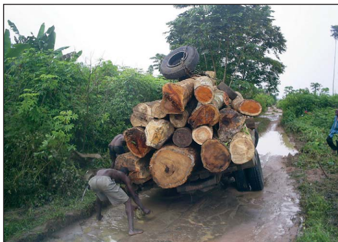
Figure 2. Illegal timber fellers at the former Ologbo Forest Reserve (4,000 ha), Edo State, southwest Nigeria. Today a private reserve. Photograph © Elizabeth J. Greengrass. July 2007.

been completely converted to farmland, with no natural forest remaining. While eight of the 14 forest reserves, in theory, make up two contiguous forest blocks (the Idanre, Akure-Ofosu, Ala, Owo, Ohosu complex and the Omo, Oluwa, Shasha complex), in reality the remaining natural forest within these reserves is becoming increasingly fragmented and disturbed as a result of unregulated and unsustainable timber extraction practices. Factors affecting the quality of the habitat at each site included their size and their distance from major towns and roads. Southern Nigeria has a well developed road network with some forest reserves traversed by major roads. Illegal squatter farming camps invariably follow logging activity. While these camps may have originated as hunting camps in the recent past, they have now evolved into permanent farming settlements. Hunting activity is prevalent at all the sites but it is the combined influence of all these activities that threaten remaining wildlife populations.