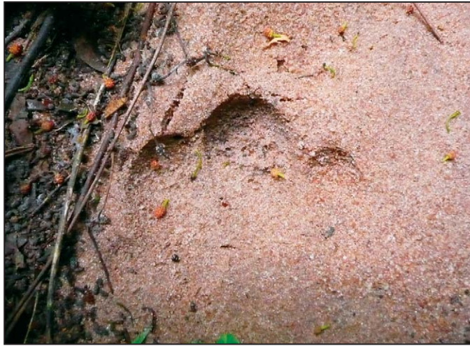
Figure 7. A chimpanzee knuckle print preserved in wet sand along a logging road at the former Ologbo Forest Reserve, Edo State, southwest Nigeria. This picture was taken in May 2008, after active law enforcement had been implemented and loggers were forced to leave.

2005), and a recent paper showing that core area quality is associated with variance in reproductive success (Emery-Thompson et al. 2006) suggests that, by lowering the quality of their habitat, logging pressure may affect the reproductive success of female chimpanzees. A reduction in food availability associated with logging may decrease the animals' condition and increase their vulnerability to disease or parasites (Milton 1996 in Chapman et al. 2000) and also increase infant and juvenile mortality. Despite their behavioral adaptability, chimpanzee communities have defined territories that limit the individuals' abilities to avoid widespread human-induced disturbance.