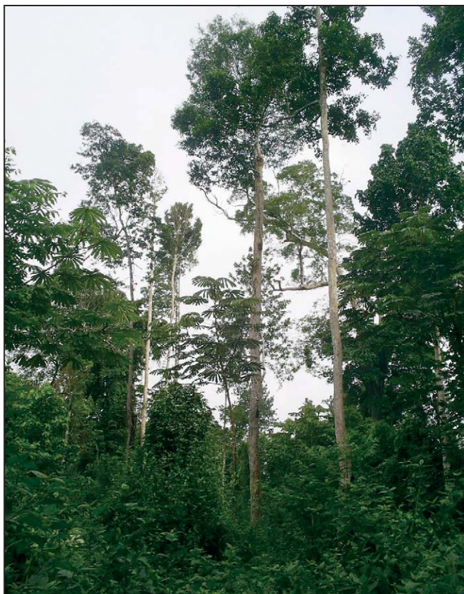
Figure 5. The canopy at the former Ologbo Forest Reserve (4,000 ha), Edo State, southwest Nigeria. The forest in this reserve, now privately owned, is badly damaged, and one of the poorest examples of mature secondary forest in the region. Photograph © Elizabeth J. Greengrass. 2007.

the region. The findings of this survey that natural resources in southwestern Nigeria are being over-exploited at an unsustainable rate are not new and have been reported by Agbelusi (1994), Anadu (1987), Anadu and Oates (1982), and as far back as the 1960s (Petrides 1965 in Anadu 1987). Clearly, many wildlife species, chimpanzees included, have been threatened by widespread habitat loss for a very long time.