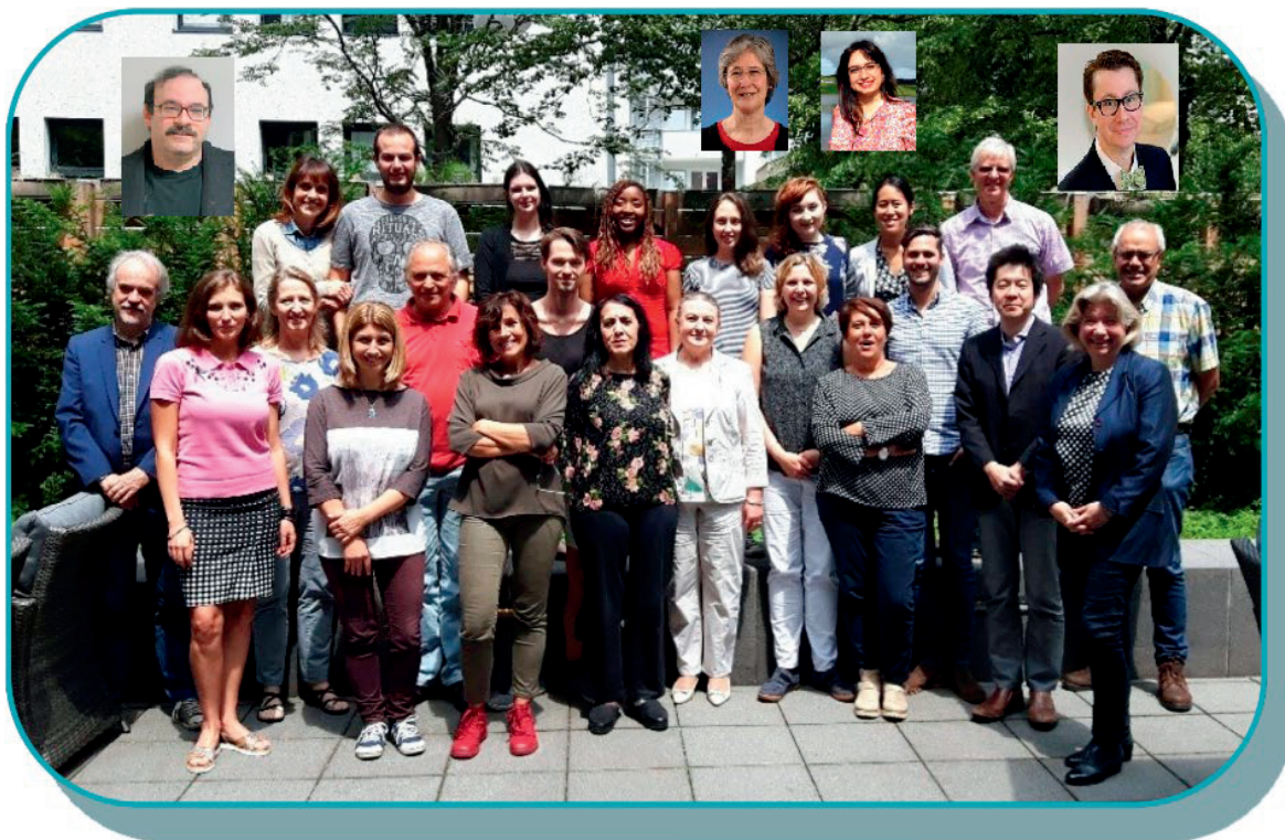
FIG. 2. The LDLensRad Consortium members in Munich, Germany in 2018.

brilliant skills of data analysis and interpretation. He co-authors three of the manuscripts in this special issue.