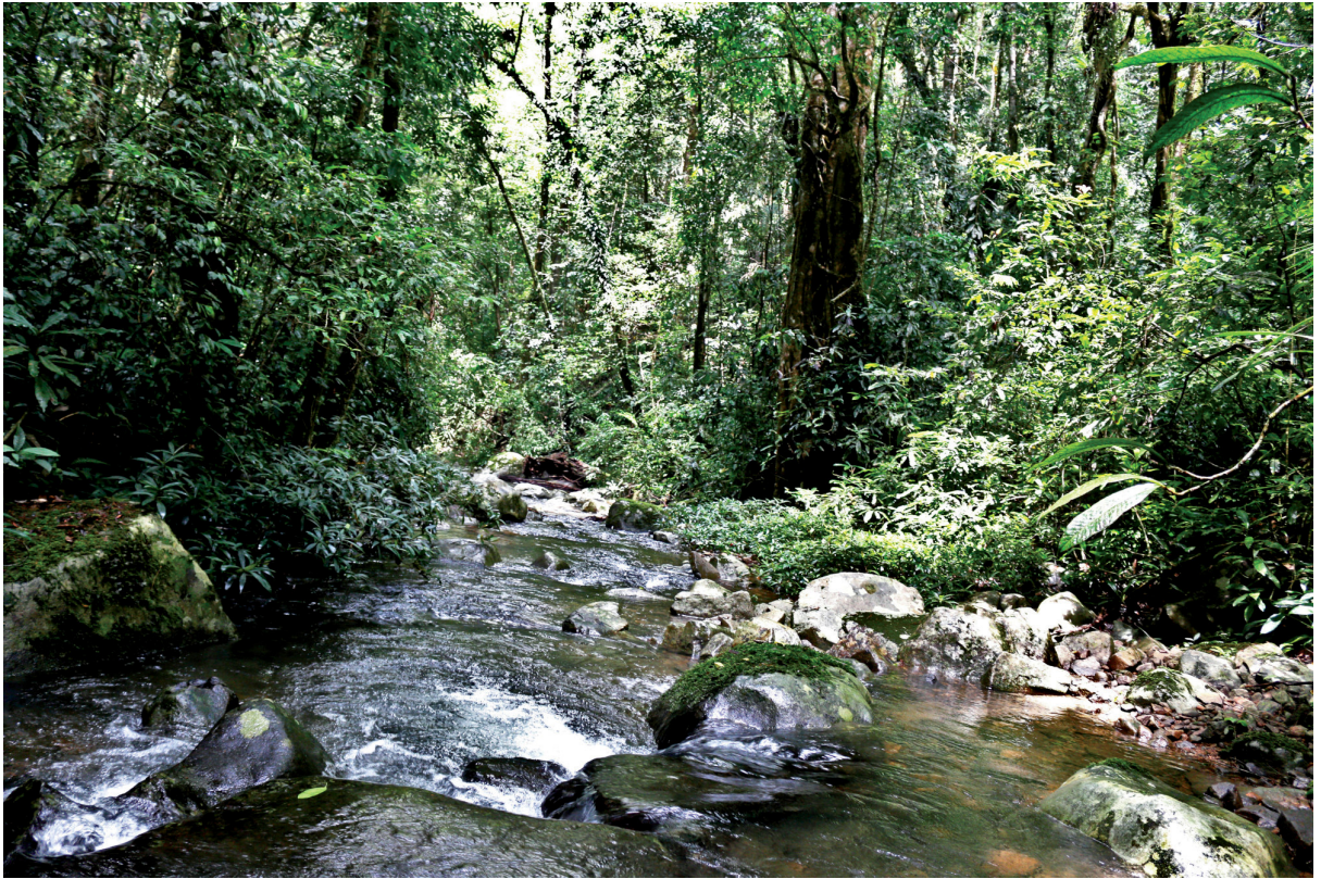
Fig. 6. Ta Dung Nature Reserve, Dak Nong Province, Central Highlands, Vietnam.