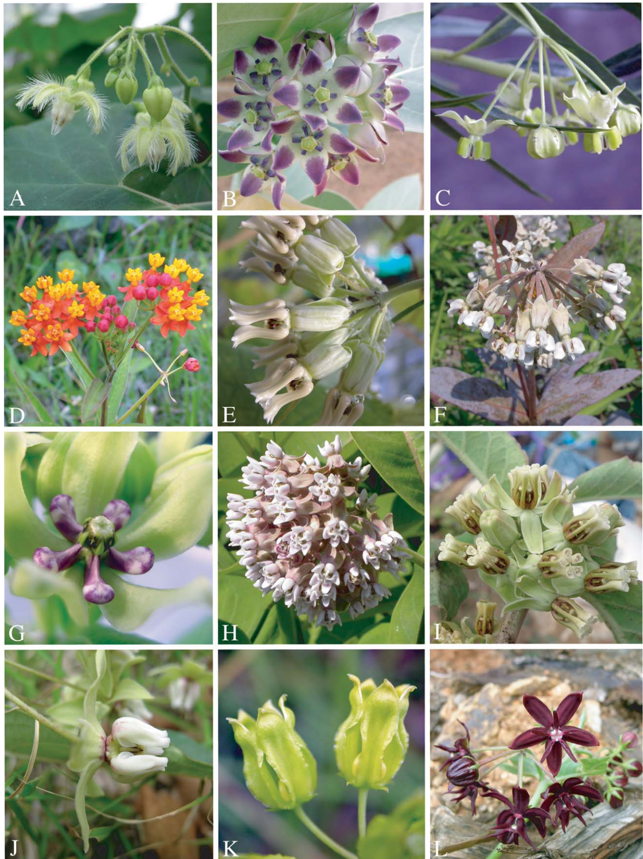
FIG. 1. Diversity of floral morphology in Asclepias and related genera, illustrated by representatives of major clades. A. Pergularia daemia , outgroup (cultivated, seed from Tanzania). B. Calotropis procera , outgroup (cultivated). C. Gomphocarpus fruticosus , clade C (cultivated, seed from Namibia). D. Asclepias curassavica , clade F (Querétaro, Mexico). E. Asclepias subulata , clade I (cultivated, seed from Sonora, Mexico). F. Asclepias glaucescens , clade J (Michoacán, Mexico). G. Asclepias viridis , clade K (cultivated, seed from Mississippi, U. S. A.). H. Asclepias syriaca , clade L (Virginia, U. S. A.). I. Asclepias oenotheroides , clade M (Oaxaca, Mexico). J. Asclepias auriculata , clade N (Oaxaca, Mexico). K. Asclepias pedicellata , clade O (Florida, U. S. A.). L. Asclepias melanantha , clade P (Oaxaca, Mexico).