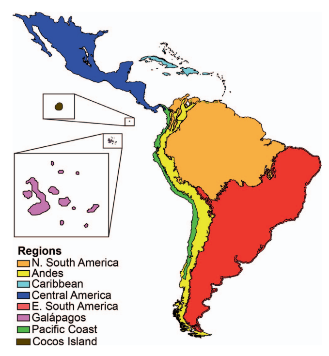
FIGURE 1. Map of biogeographic areas used in BioGeoBEARS eight-area regime. Five-area regime combined the four regions of South America mainland that are shown here.

likelihood analyses (>70 Bootstrap Support). This change in topology potentially alters the biogeographic interpretation of the origin of Darwin's finches. In addition, advances in biogeographic analyses in the last 15 yr indicate that a reassessment of the biogeography of the group is warranted. The R package BioGeoBEARS provides a framework for testing maximum likelihood and Bayesian models to reconstruct ancestral ranges (Matzke 2013a). The ability to customize models within this package allows new model types to be compared in addition to more widely used models. Therefore, we use the Burns et al. (2014) phylogeny and the more modern statistical approaches available through BioGeoBEARS to test a variety of biogeographical models. Using maximum likelihood, we estimate the ancestral ranges for all species in the subfamily Coerebinae and provide an update to the biogeographical analyses of Burns et al. (2002). Using this reconstruction, we evaluate the 2 proposed hypotheses for the origin of Darwin's finches in an attempt to provide consistency to the literature and to better understand the evolutionary context from which this radiation evolved.