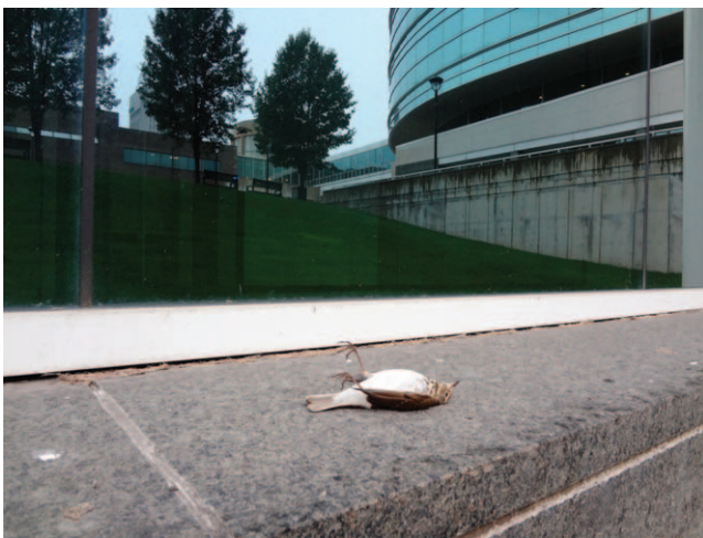
FIGURE 1. A Swainson's Thrush killed by colliding with the window of a low-rise office building on the Cleveland State University campus in downtown Cleveland, Ohio.

Research on bird–building collisions typically occurs at individual sites with little synthesis of data across studies. Conclusions about correlates of mortality and the total magnitude of mortality caused by collisions are therefore spatially limited. Within studies, mortality rates have been found to increase with the percentage and surface area of buildings covered by glass (Collins and Horn 2008, Hager et al. 2008, 2013, Klem et al. 2009, Borden et al. 2010), the presence and height of vegetation (Klem et al. 2009, Borden et al. 2010), and the amount of light emitted from