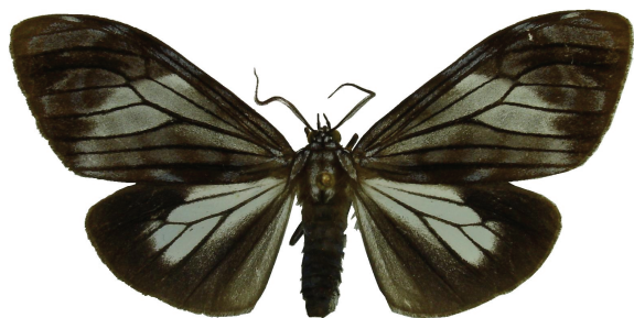
FIG. 1. Male, Correbidia fana (Druce, 1900). First record for Mexico. Specimen deposited at the Entomology Collection ECO-SC-E, in San Cristobal de las Casas, Chiapas, Mexico.

The Euchromiina and Ctenuchina include notable mimics of wasps and are sometimes referred to as “wasp moths.” They are represented by approximately 2,400 Neotropical species, but only 240 of them are known from Mexico (Heppner 1991; Hernández-Baz 2009, 2012a). The Euchromiina and Ctenuchina sub tribes are supported by two synapomorphies: loss of tympanal pocket V and an enlarged tympanal hood (Simmons & Weller 2006)