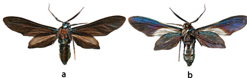
FIG. 2: Eclosed male Antichloris eriphia (Fabricius, 1776) (forewing length 18 mm, wingspan 38 mm; antennae mended) in Paramaribo, Suriname. a: dorsal view; b: ventral view. Specimen deposited in Naturalis Biodiversity Center, Leiden, Netherlands.