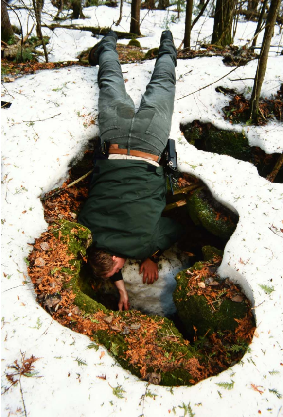
Fig. 2. Examining the entrance to an occupied American black bear ( Ursus americanus ) den in a vertical fissure in the dolostone bedrock, Bruce Peninsula, Ontario, Canada.

yearling and subadult bears carried radiocollars for a sufficient time to yield information on denning requirements of subadults. The logistics of handling bears in rock crevices did not allow us to obtain weights or den measurements for all individuals.