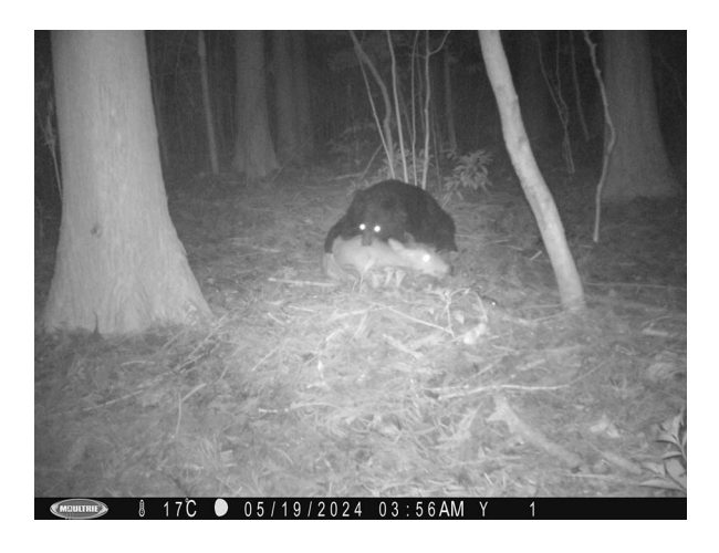
Fig. 1. On 19 May 2024, at 03:56 hours (am), an Asiatic black bear ( Ursus thibetanus ; bear B) subdued a sika deer ( Cervus nippon ; deer A), which was caught in the leg-hold snare trap.

of view (Video S4, Supplemental material ). Bear B was recorded at the edge of the camera's field of view until 04:34 hours, during which time deer A likely died (assessed by a lack of motion), and bear B likely began feeding (e.g., behavior was recorded with the bear