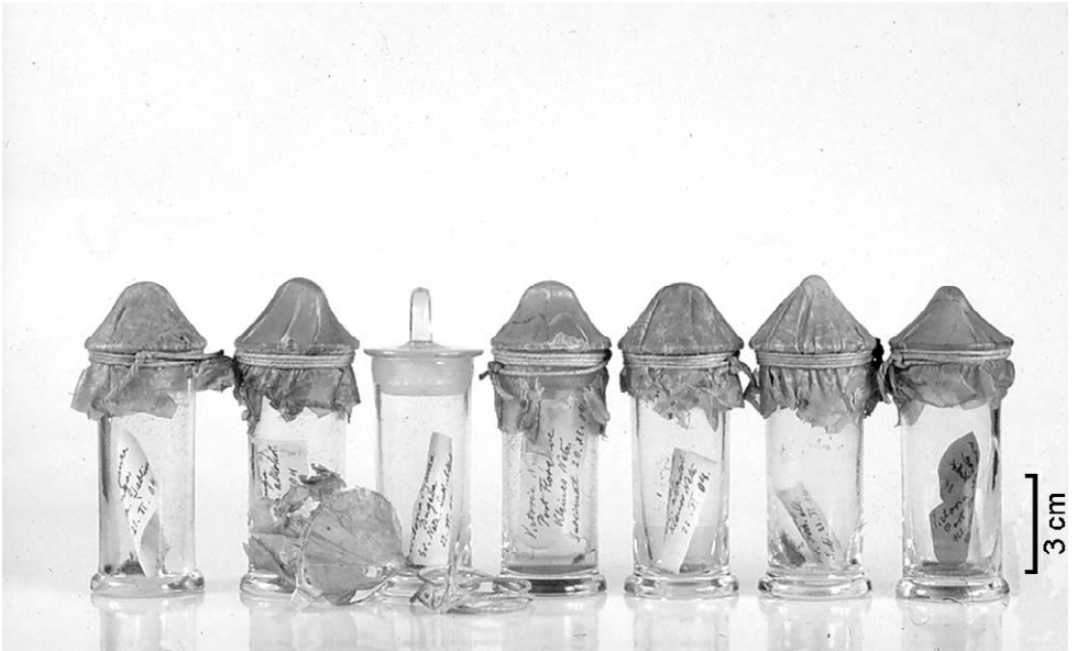
Fig. 3. Borgert's samples from Lake Victoria of 1904.

Müller's detailed list of examined samples (1904: 10–13), and Klee & Casper's statement (1992) that Müller's samples are missing, made it possible to recognize the identity as well as the value of these samples.