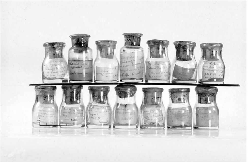
Fig. 2. Some of Fülleborn's samples from Lake Nyassa and surrounding waters of 1897–1900.

December 1897 and February 1900 either by Friedrich Fülleborn, a medical doctor stationed at the town Langenburg at Lake Nyassa, or Walther Goetze, a young botanist sent out by Engler to collect plants, and who he died on the expedition (Goetze 1899, Engler 1899, 1902). Almost all of Fülleborn's samples are extant whereas several of Goetze's are missing. This part of the collection comprises 91 samples (for some of Fülleborn's jars, see Fig. 2).