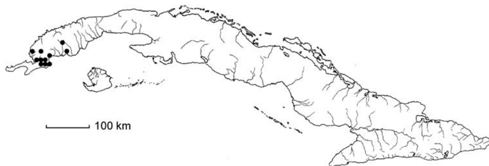
Fig. 1. Map of the Cuban distribution of Cleome guianensis .

Distribution. – From S Mexico (Baja California to Chiapas) and Belize through Mesoamerica to Colombia, British Guiana and Brazil. In westernmost Cuba it grows in pinelands on white sand (Fig. 1).