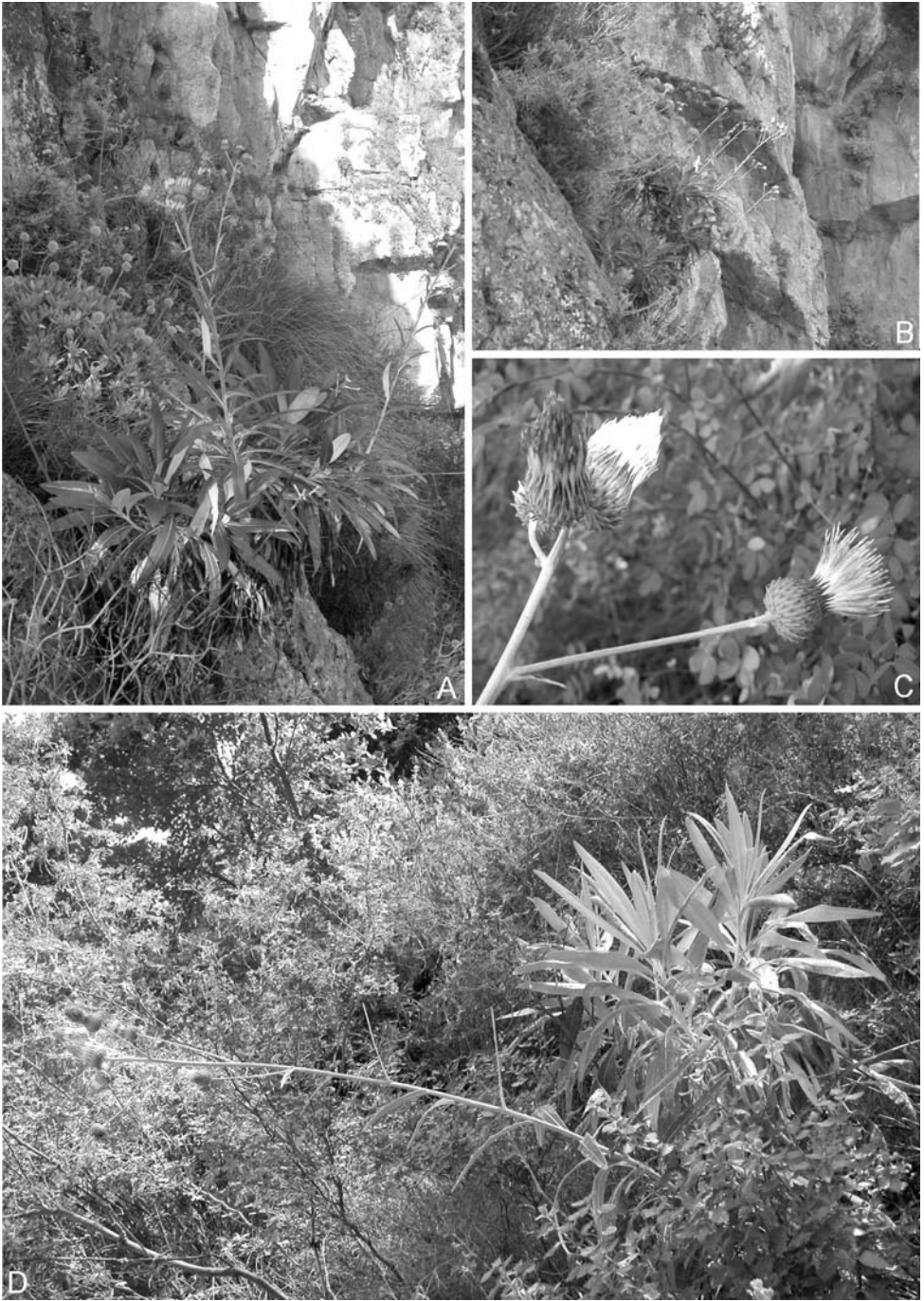
Fig. 4. Ptilostemon greuteri – A-B: in the natural rocky calcareous habitat; C: detail of the synflorescence; D: in the maquis near the rocky habitat.