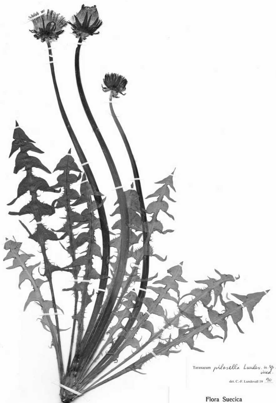
Fig. 6. Taraxacum pilosella , holotype (S).