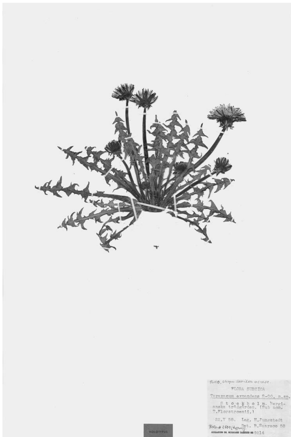
Fig. 2. Taraxacum expandens , holotype (S).