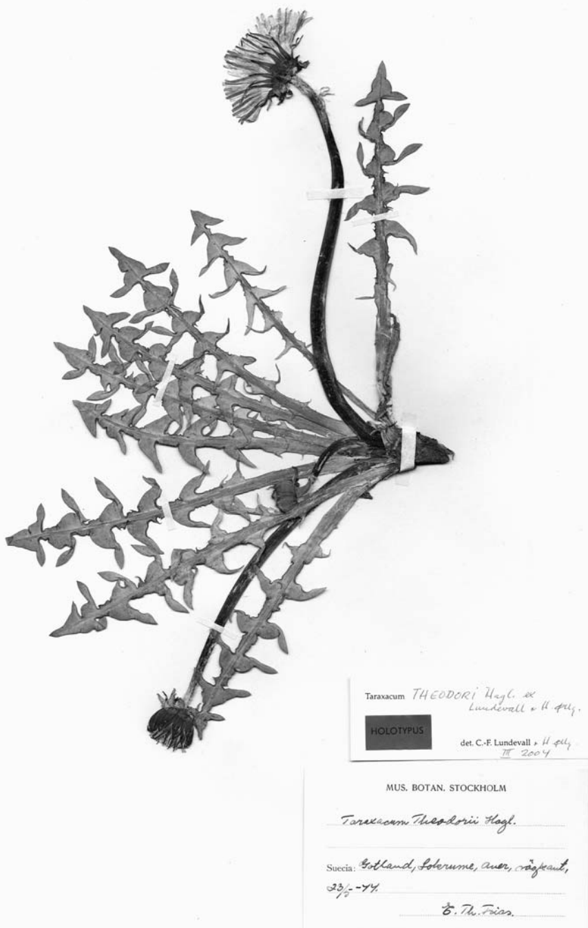
Fig. 7. Taraxacum theodori , holotype (S).