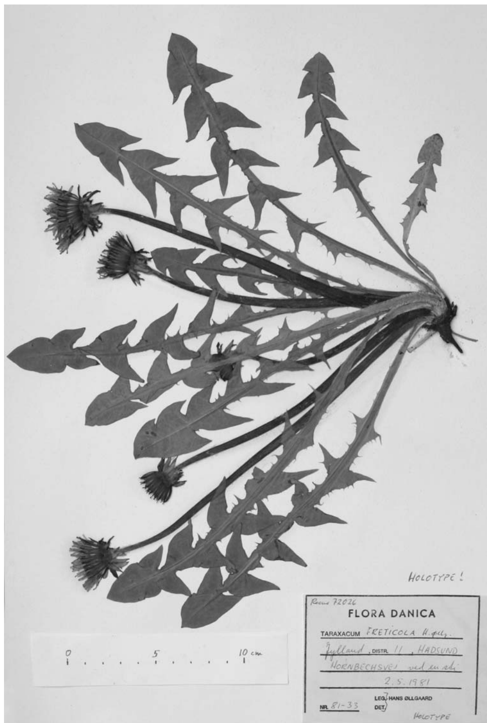
Fig. 1. Taraxacum freticola – holotype specimen.