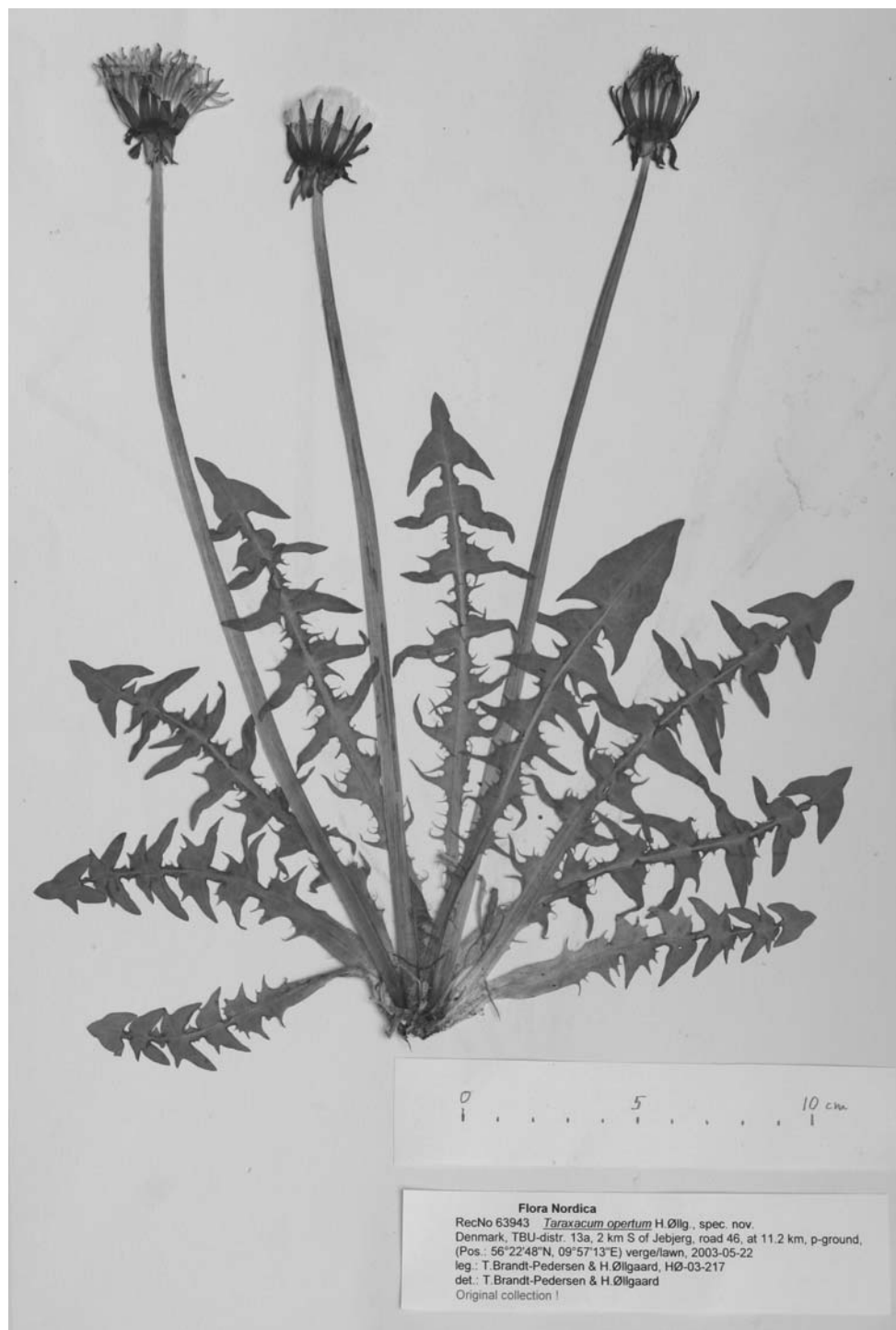
Fig. 6. Taraxacum opertum – holotype specimen. Downloaded From: https://bioone.org/journals/Willdenowia on 29 May 2024 Terms of Use: https://bioone.org/terms-of-use