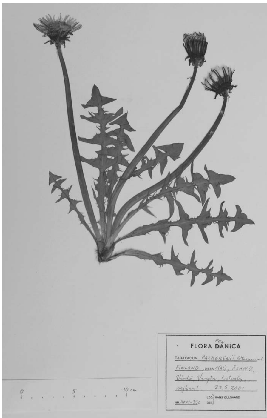
Fig. 7. Taraxacum palmgrenii – specimen Øllgaard & Räsänen HØ-01-330 (C).