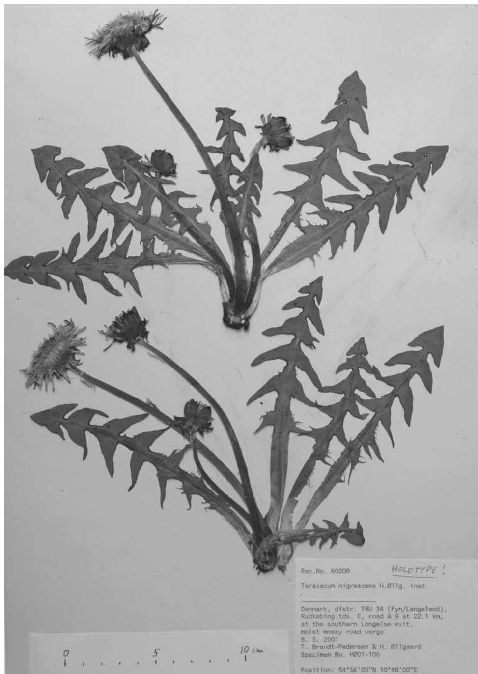
Fig. 5. Taraxacum nigrescens – holotype specimen.