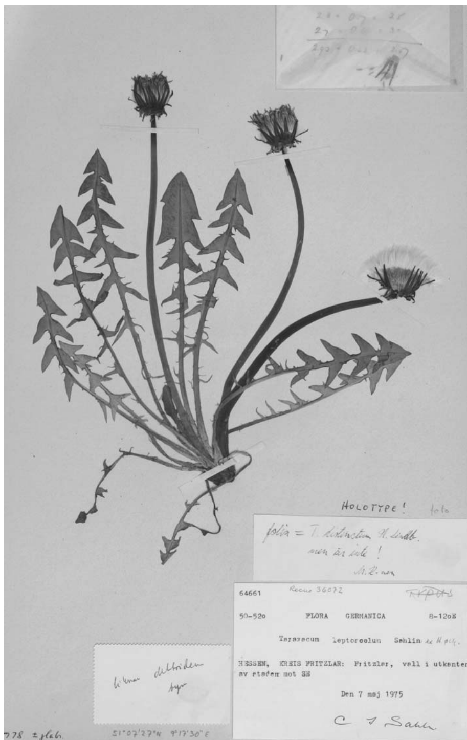
Fig. 4. Taraxacum leptoscelum – holotype specimen.