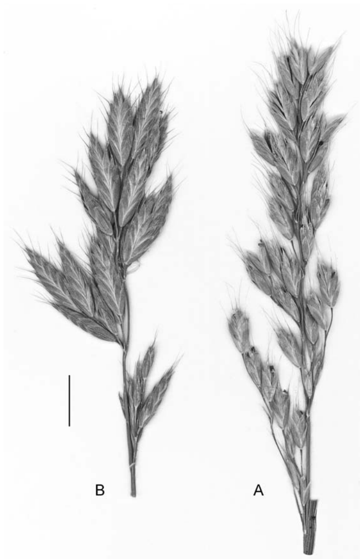
Fig. 1. A: Bromus parvispiculatus (from the holotype, Willing 87413). – B: B. hordeaceus subsp. mediterraneus (France, Var, 1860, F. Schultz, herbarium normale, nov. Ser. Cent. 13, No. 1272 as B. molliformis ). – Scale bar = 1 cm.

of glumes and lemmas on drying, a relative high lemma awn insertion of 0.5-1.7 mm below the obtuse or short-bilobed lemma apex as well as the more or less spreading, softly and densely long-hairy indumentum at least on the lower leaf sheaths (except for B. hordeaceus subsp. longipedicellatus , a probably hybrid derivative; Spalton 2001). The interrelationships of all these taxa are obscure. Some similarities in the loose panicle configuration of B. hordeaceus subsp. pseudothominei (6.5-8 mm long lemmas; the mostly non-weedy subsp. thominei , similar in lemma size, differs, e.g., by its compact inflorescences!) and B. parvispiculatus may one lead to the assumption that the latter is the Mediterranean vicariant of the more northerly distributed subsp. pseudothominei and should therefore better be treated as a subspecies of B. hordeaceus .