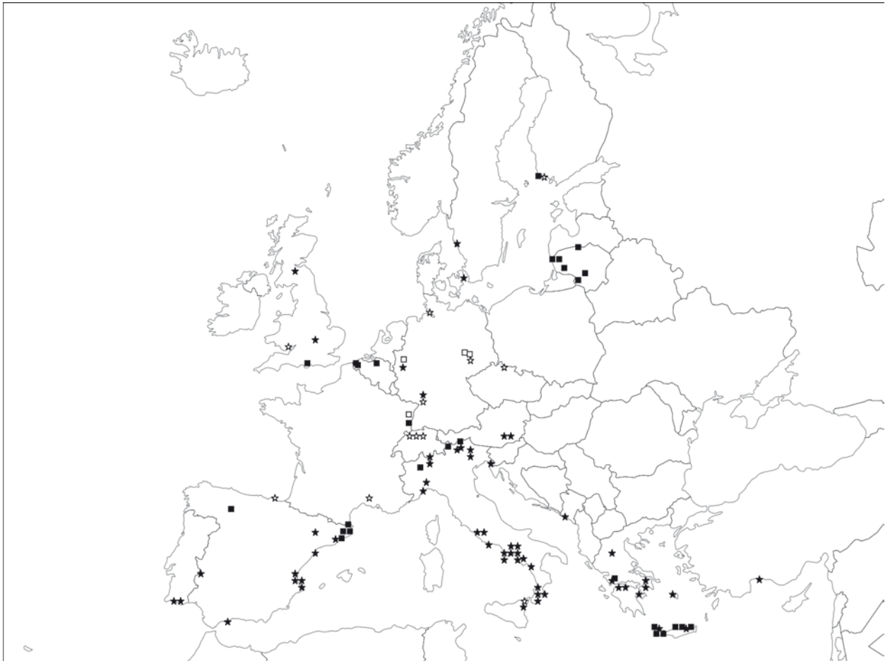
Fig. 2. Digitaria ciliaris in Europe. – Revised herbarium vouchers (empty stars: collected before 1950, filled stars: after 1950) and records drawn from the literature (empty squares: before 1950, filled squares: after 1950). In the event that literature records and herbarium vouchers coincide, only the latter are presented on the map. Symbols may stand for more than one record if sites are too close to be indicated separately. The Atlantic islands (Macaronesia) with their respective records are not shown. See the text for details.

MONTENEGRO: Tivat, Lastra, st. betonski zid iznad mora, 15.9.1996, Karamari (?) 1005 (BEOU).