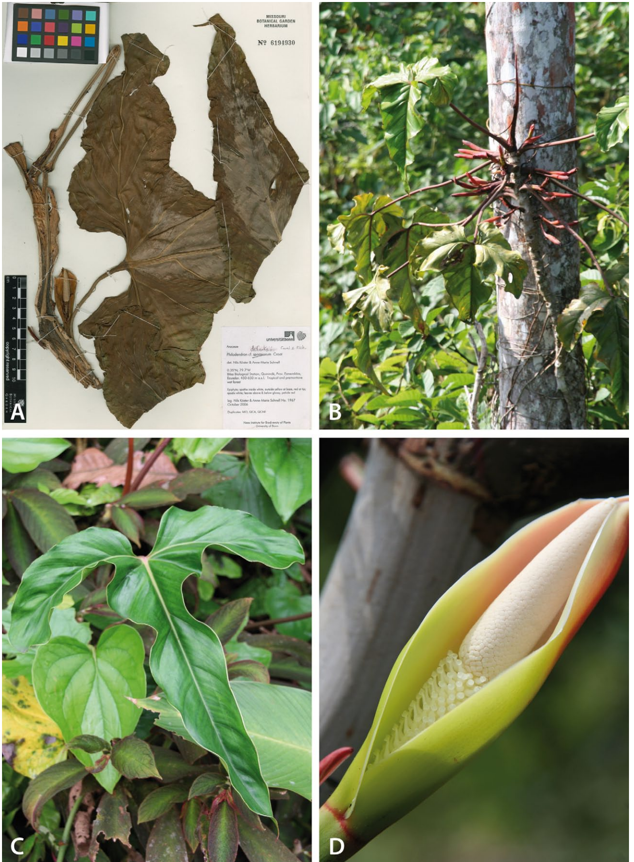
Fig. 1. Philodendron delinksii – A: holotype specimen at MO, Köster & Schnell 1967; B: habit of specimen at type locality, Ecuador, Esmeraldas, Bilsa Biological Station; C: leaf of specimen at type locality, Ecuador, Esmeraldas, Bilsa Biological Station; D: fresh inflorescence of type collection, Köster & Schnell 1967. – Photographs by C. Kostelac (A) and N. Köster (B–D).