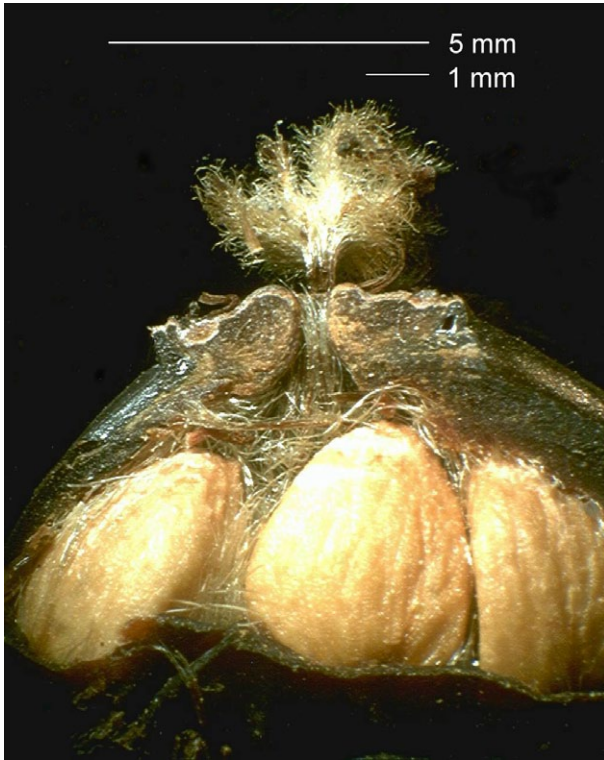
Fig. 4. Rosa micrantha subsp. chionistrae – cross section through the upper part of a hip collected in November, sepals dropped off; disc broad, orifice narrow, styles villose (Hand 3684).

exceeding 1 cm in length, glandular-setose with a few scattered hairs [ T : in the photos most pedicels are hidden by bracts; the three visible pedicels are smooth or sparsely glandular-setose / P : “pedunculis nudis vel raro glandulis stipitatis nonnullis instructis” / M : more or less densely glandular-setose (Fig. 3)]; receptacle narrowly ovoid or ellipsoid at anthesis, about 1 cm long, 0.4–0.5 cm wide, glabrous or thinly glandular-setose at the extreme base; sepals foliaceous with 4–6 narrowly [ M : about 1 mm wide] lanceolate lateral lobes, about 1.5 cm long, 0.4 cm wide at base, conspicuously glandular at the abaxial surface, spreading or reflexed [ M : reflexed] after anthesis, deciduous in fruit; petals white, broadly obovate, 2–2.3 cm long, about 2 cm wide, apex shallowly emarginate; stamens numerous, filaments glabrous, 2.5–3 mm long; anthers oblong, about 2 mm long, 1.5 mm wide; disk [ M : with a diameter of about 4.5 mm] prominent, conical [ M : low conical (Fig. 4)], glabrous, with an aperture about 0.7 mm diam.; styles free, pilose [ M : densely pilose, nearly lanate (Fig. 4)], forming a low dome about 3.5 mm diam. [ M : a little exserting above the orifice], stigmas capitate. Fruit broadly ovoid or subglobose [ M : ovoid, 1.2–1.5 as long as wide], about 1.5 cm long and 1.2–1.5 cm wide, scarlet; achenes bluntly angular, pale brown, about 5 mm long, 3 mm wide.