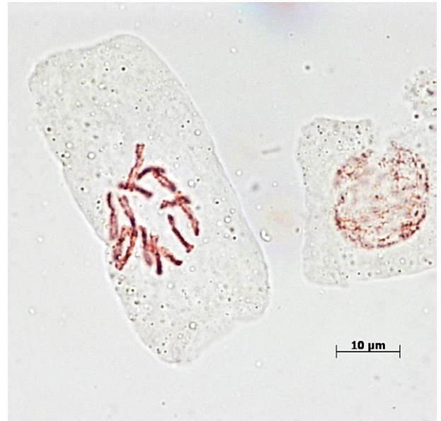
Fig. 1. Papaver paphium , metaphase of root tip mitose, 2n = 14 .

The leaf shape of Papaver paphium is distinctive. The lower leaves have long, winged petioles covered with up to 2 mm long patent white hairs; the lamina is entire, lyrate or deeply three-lobed, rarely with two additional short obtuse lobes, usually glabrous or covered with sparse white hairs along the veins. The single (rarely two) cauline leaf near the stem base is sessile. The petals are contiguous, delicate pale orange, lacking dark marks. The stigmatic disc has 5–7 crenate, rounded lobes with a hyaline margin, the radiating stigmas do not reach the tip of the lobes.