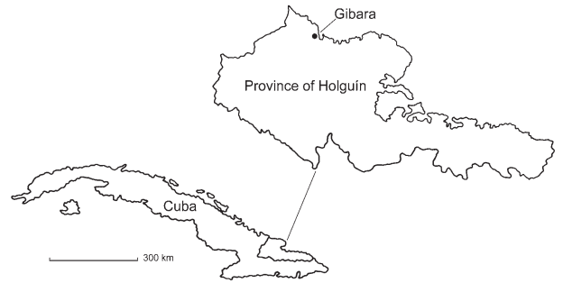
Fig. 3. Geographic distribution of Acanthodesmos gibarensis .