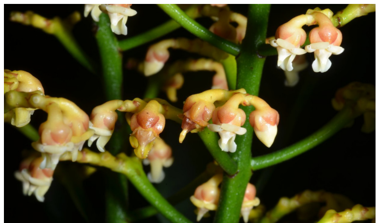
Fig. 5. Rinorea gabonensis with four petals reflexed and anterior petal erect.