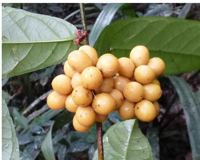
Fig. 1. Decorsella paradoxa showing berry-like seeds from two fruits. – Photographed by Carel Jongkind in Liberia from Jongkind & al. 11998.

Decorsella arborea Jongkind, sp. nov. – Fig. 2A–N. Holotype: Gabon, Ngounié, Missionary Station at Mouya-