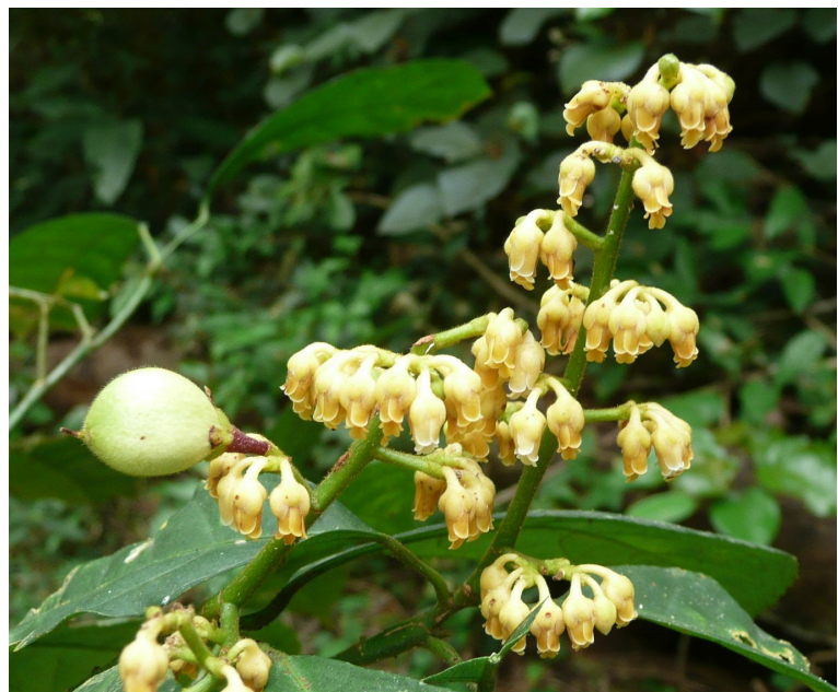
Fig. 4. Rinorea longicuspis showing zygomorphic flowers with longest (anterior) petal ending straight and flat. — Photographed by Carel Jongkind in Liberia from Jongkind & al. 9192.