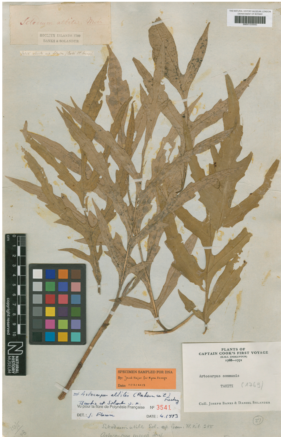
Fig. 2. Specimen of Artocarpus altilis, showing two branches with three leaves, collected by Banks & Solander in 1769 in Tahiti, preserved in BM (barcode BM001209950).