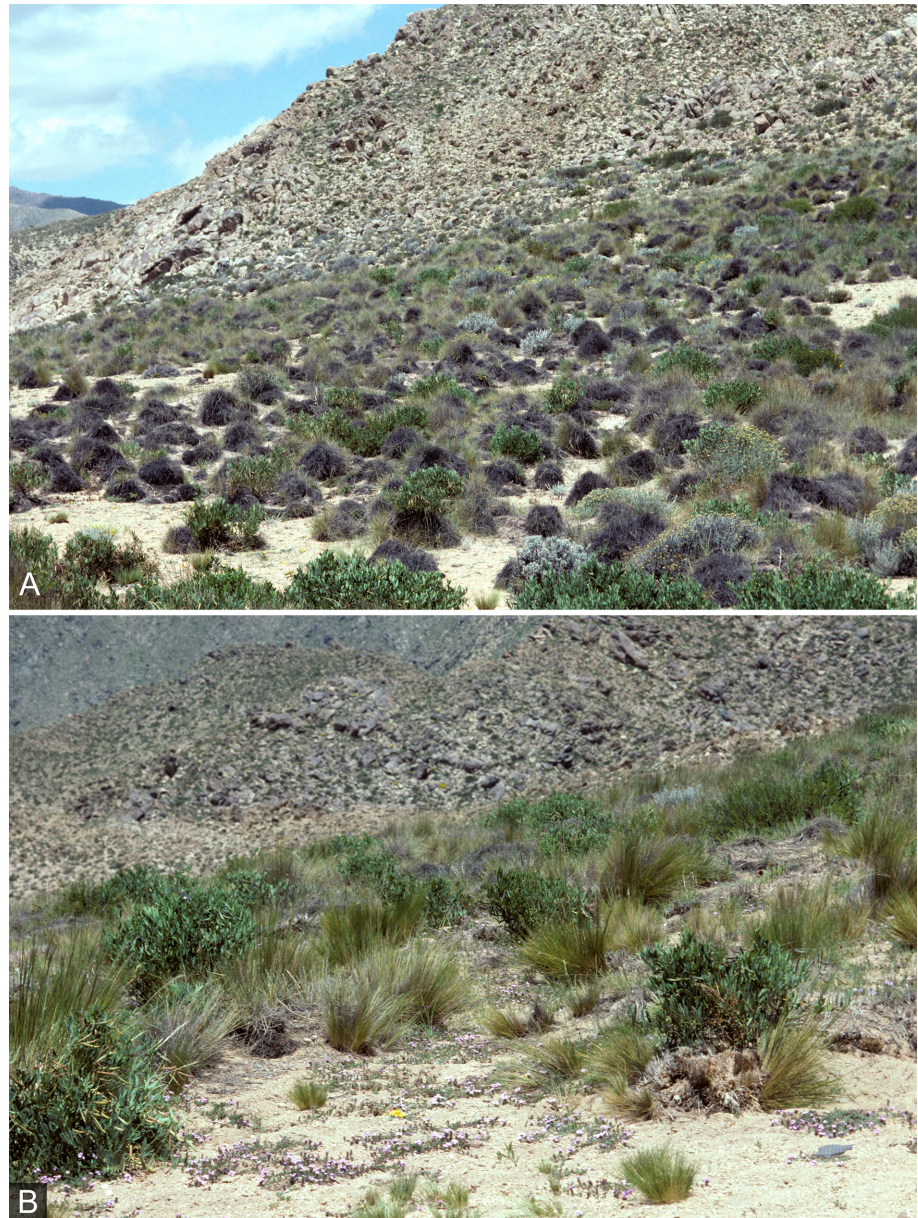
Fig. 2. Locality and environment of Viola beati – A: general situation on pass to north-northeast of Villavil, Catamarca, Argentina at 3400 m, 20 Feb 1994; B: same area as A, showing vegetation with sandy clearings as habitat of V. beati , 20 Feb 1994. – Both photographs by Urs Eggli.

The existence or not of a lower petal nectar spur remains unresolved due to the undesirability of risking damage to the delicate floral structure of this unique specimen by dissection. It may either be concealed and very short, as in other species of the section (pers. obs.), or absent. One allied species only, Viola granulosa Wedd., does lack this feature (Weddell 1864; Baehni & Weibel 1941).