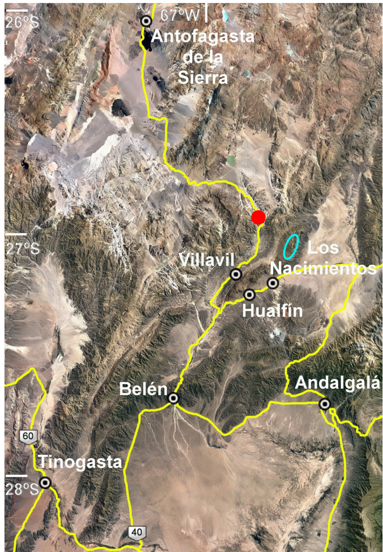
Fig. 4. Viola beati type locality (red circle) in Catamarca Province, Argentina, with area containing type locality of V. singularis (cyan ellipse). – Google Earth ( https://www.google.com/earth/ ), modified by John Watson and BGBM Berlin.