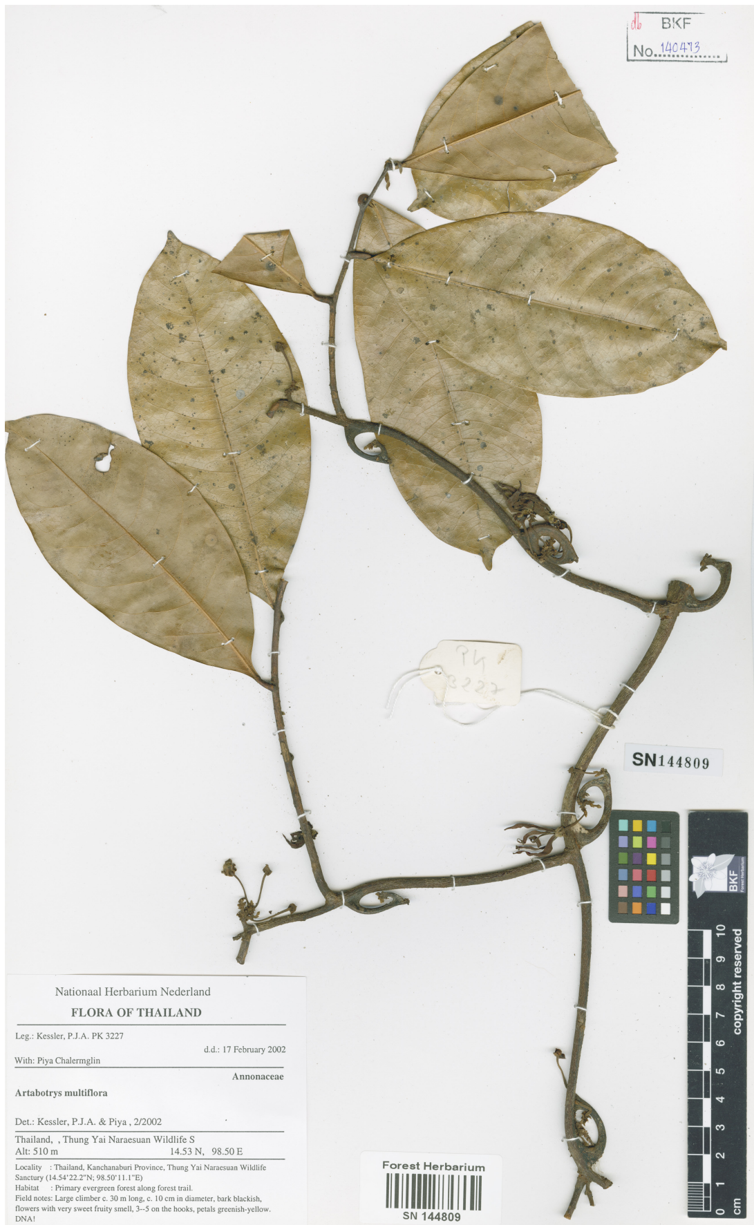
Fig. 3. Holotype of Artabotrys angustipetalus Photikwan & Chaowasku – Kessler PK 3227 (BKF [SN144809]).