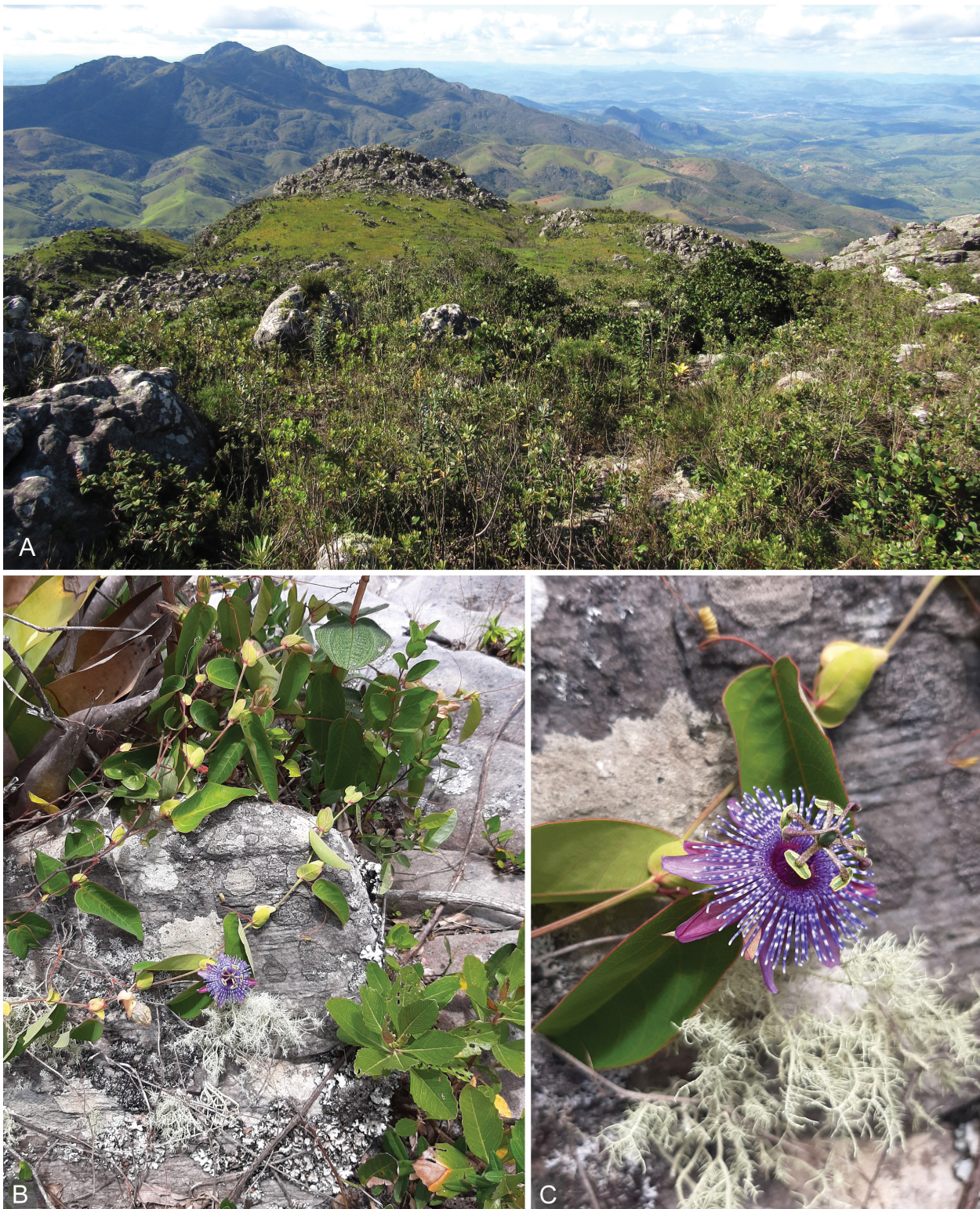
Fig. 3. A: Campos rupestres at the top of Pico do Padre Ângelo, Conselheiro Pena, Minas Gerais, Brazil; B: habitat of Passiflora ita ; C: detail of P. ita growing among rocks.

base cordate, rounded to truncate, margin entire, apex emarginate to obtuse. Inflorescence 1-flowered. Peduncle green to reddish, 17–32 mm long. Bracts whorled, green to pinkish, ovate to narrowly ovate, 10.3–21.5 × 7–9 mm, glabrous. Pedice green to reddish, 4.4–6.4 mm long. Flowers 30.1–54.5 mm in diam.; hypanthium cam-