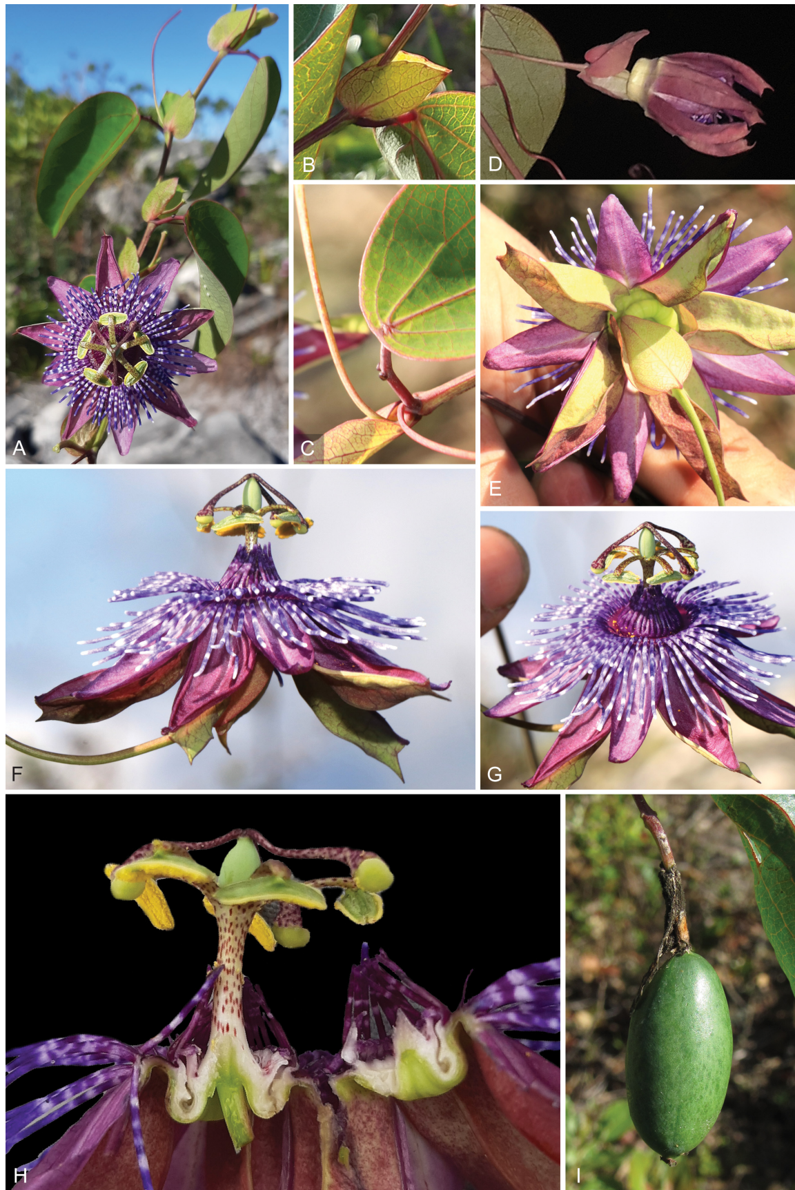
Fig. 2. Passiflora ita – A: habit; B: stipule; C: peltate leaf lamina and detail of glands on petiole; D: flower bud; E: detail of bracts; F: flower, lateral view, showing three well-defined series of corona filaments; G: general view of flower; H: sagittal section of flower; I: fruit. – Photographs: A–C, E–I by Paulo Minatel Gonella; D by Ricardo da Silva Ribeiro.