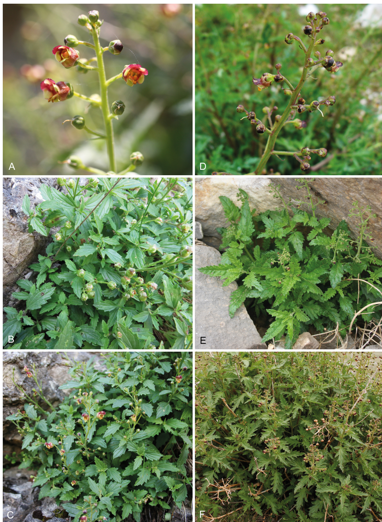
Fig. 1. Comparison of Scrophularia bulgarica (A: inflorescence; B, C: stems and leaves) and S. heterophylla subsp. laciniata (D: inflorescence; E, F: stems and leaves).