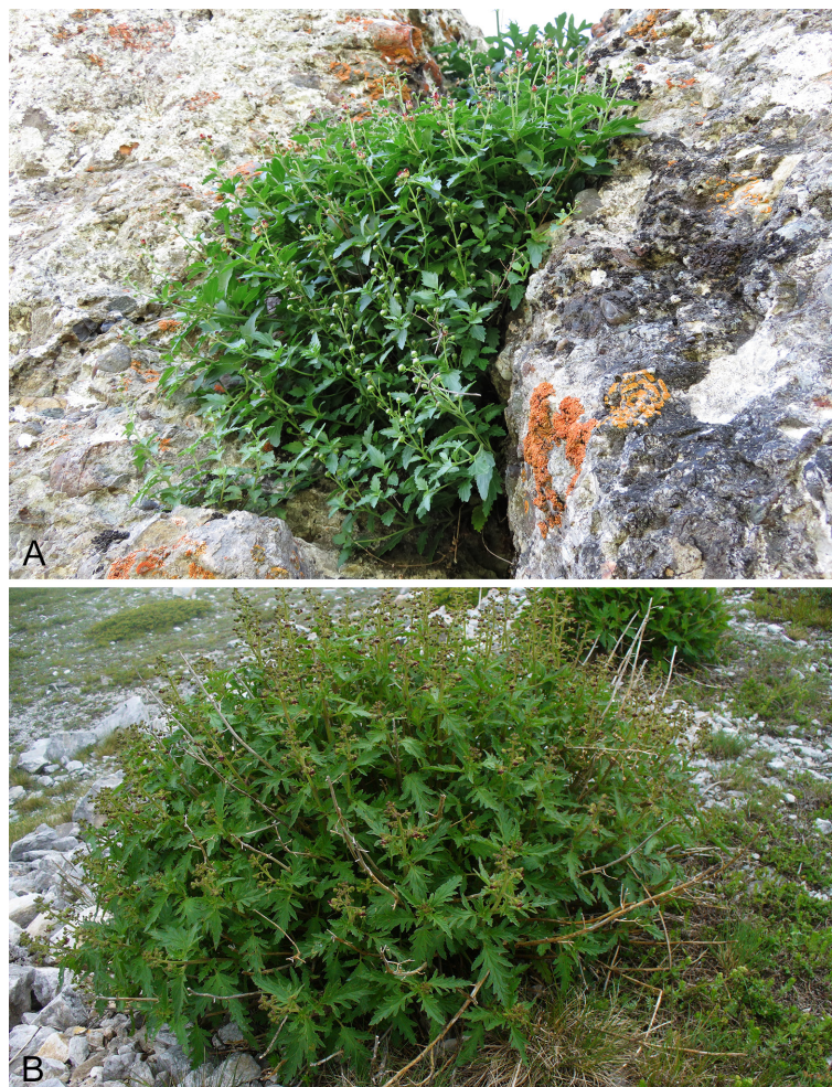
Fig. 2. Habitats of Scrophularia bulgarica (A) and S. heterophylla subsp. laciniata (B). – A: conglomerate cliffs in Sokolna reserve, C Stara Planina; B: calcareous scree slopes, near Orelyak summit, Pirin mountains.