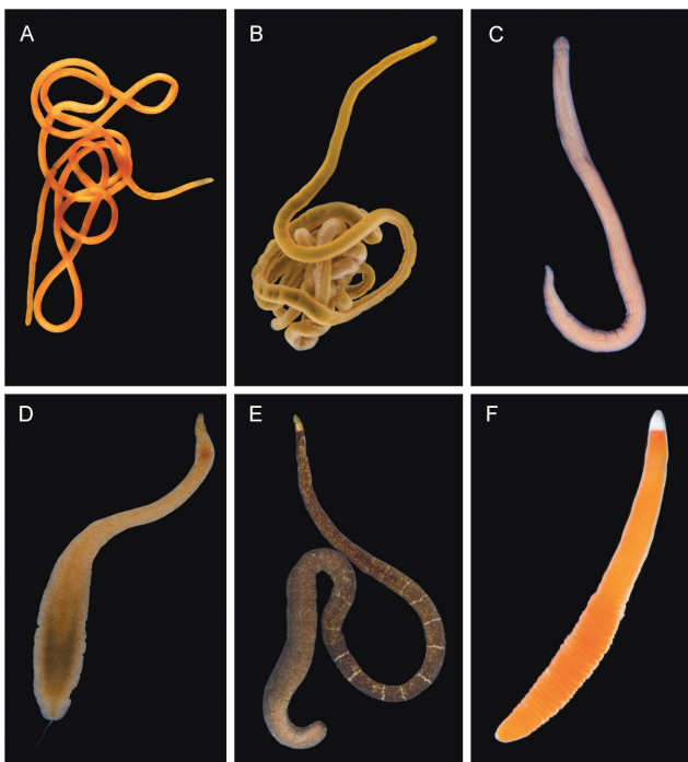
Fig. 1. Live habitus of selected specimens. (A) Cephalothrix bipunctata Bürger, 1892. (B) Cephalothrix simula (Iwata, 1952). (C) Baseodiscus delineatus (Delle Chiaje, 1825). (D) Cerebratulus fuscus (McIntosh, 1874). (E) Euborlasia elizabethae (McIntosh, 1874). (F) Leucocephalonemertes aurantiaca (Grube, 1855).

Cephalothrix cf. simula : Fernández-Álvarez and Machordom (2013), pp. 599–605, tab. 1; San Vicente do Mar, O Grove, Pontevedra, Spain; Las Represas Beach, Tapia de Casariego, Asturias, Spain; Los Chalanos Beach, Muros de Nalón, Asturias, Spain; Aramar Beach, Luanco, Asturias, Spain; Islares Beach, Castro-Urdiales, Cantabria, Spain; Colera Harbor, Colera, Girona, Spain; Faradell Islet, Cap de Creus, Girona, Spain; Alfaya et al. (2014), p. 150, tab. 2; Las Represas Beach, Tapia de Casariego, Asturias, Spain; Faradell Islet, Cap de Creus, Girona, Spain; Fernández-Álvarez and Machordom (2014), pp. 34–37, figs. and text, table on p. 37; San Vicente do Mar, O Grove, Pontevedra, Spain;