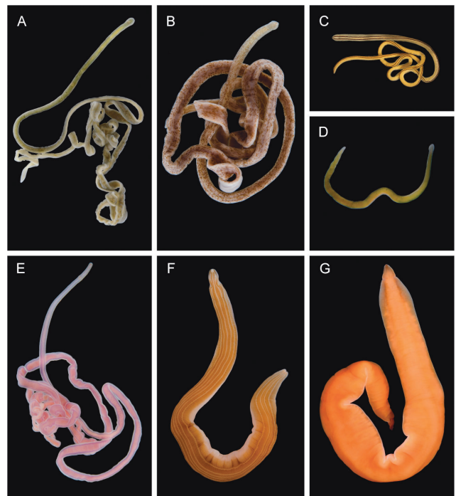
Fig. 3. Live habitus of selected specimens. (A) Emplectonema gracile (Johnston, 1837). (B) Emplectonema neesii (Ørsted, 1843). (C) Nemertopsis bivittata (Delle Chiaje, 1841). (D) Zygonemertes virescens (Verrill, 1879). (E) Tetranemertes antonina (Quatrefages, 1846). (F) Drepanophorus spectabilis (Quatrefages, 1846). (G) Paradrepanophorus crassus (Quatrefages, 1846).

Nemertes gracilis : Langerhans (1880), p. 140; Madeira, Portugal.