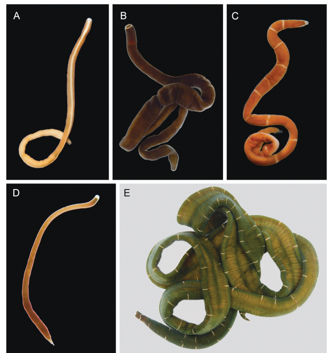
Fig. 2. Live habitus of selected specimens. (A) Lineus bilineatus (Renier, 1804). (B) Lineus grubei (Hubrecht, 1879). (C) Micrura fasciolata Ehrenberg, 1831. (D) Micrura purpurea (Dalyell, 1853). (E) NotospERMUS geniculatus (Delle Chiaje, 1828).

Additional new records. This species has also been recorded in Cape Vilán, Camariñas, A Coruña, Spain (AN11454).