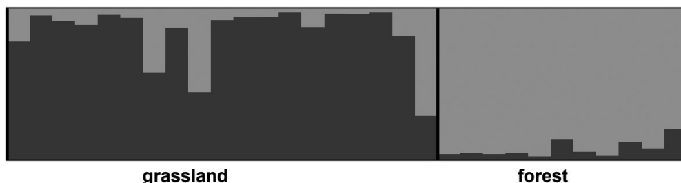
Fig. 2. Bar plot representing the proportion of clusters at K = 2 by STRUCTURE. Each serow is represented as a vertical bar, and each color bar length is proportional to the estimated membership of the cluster. The color of cluster 1 is light gray and that of cluster 2 is dark gray at K = 2 .

In the Bayesian clustering analysis, the value of \Delta K was highest at K = 2 (see Supplementary Figure S1). For the bar plot figures at K = 2 , all individuals in the forest area belonged to cluster 1, whereas 16 individuals belonged to cluster 2, one individual belong to the cluster 1, and the other